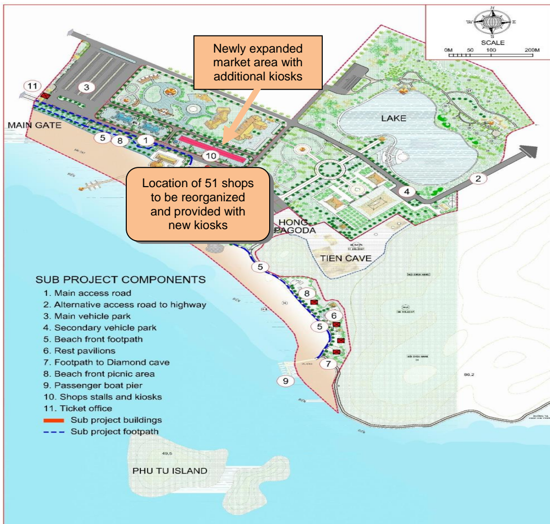
Figure 1: Phu Tu Environmental Improvements