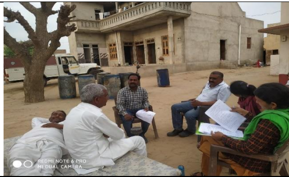
Village Bhograna Photographs of Public Consultation