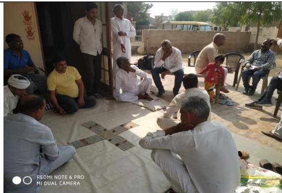
Village Meghana: Photographs of Public Consultation