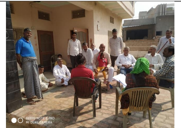
Village Meghana: Photographs of Public Consultation