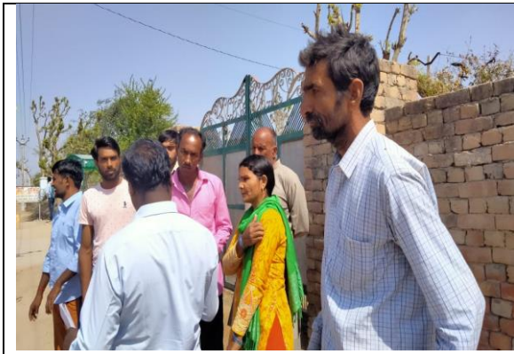
Village BhalauTal: Photographs of Public Consultation