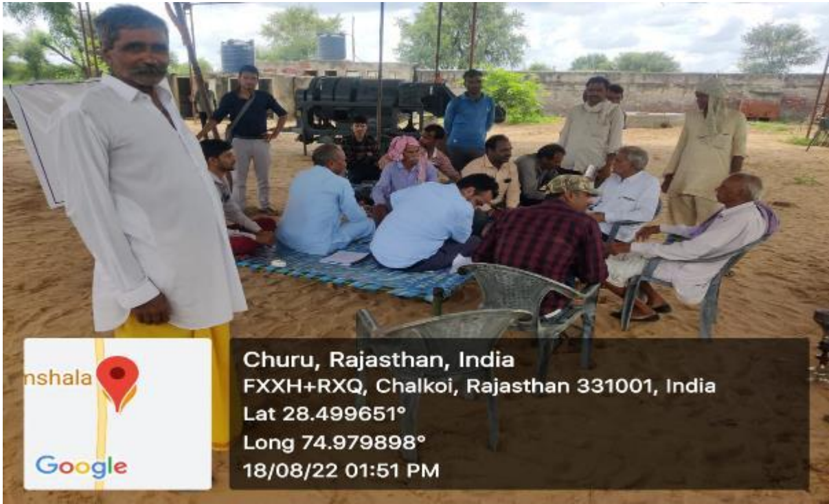
Photographs of Public consultation during SIA