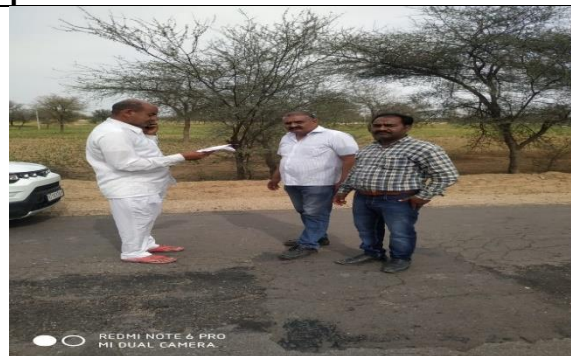
Village Meghana: Photographs of Public Consultation