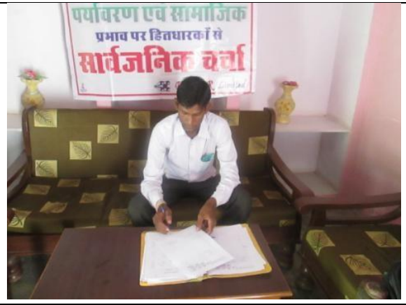
Village Chalkoi: Photographs of Public Consultation