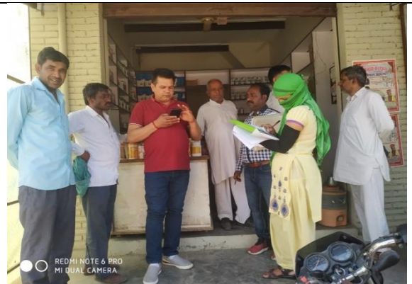
SIA team In Sehwa Village with Affected Persons Detailed Mesurement Survey Photographs