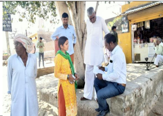
Village BhalauTal: Photographs of Public Consultation