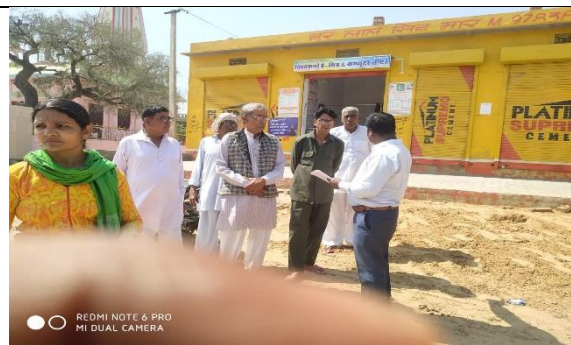
Village Meghana: Photographs of Public Consultation