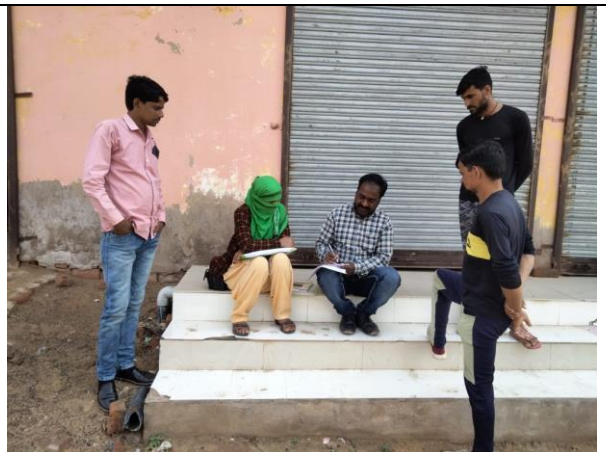
Village Meghana: Photographs of Public Consultation