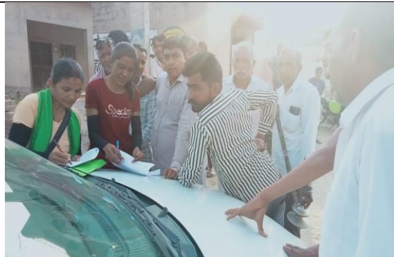
Village Dheerwass Bada: Photographs of Public Consultation