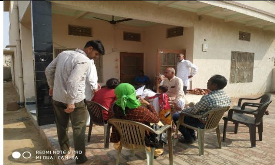
Village Meghana: Photographs of Public Consultation