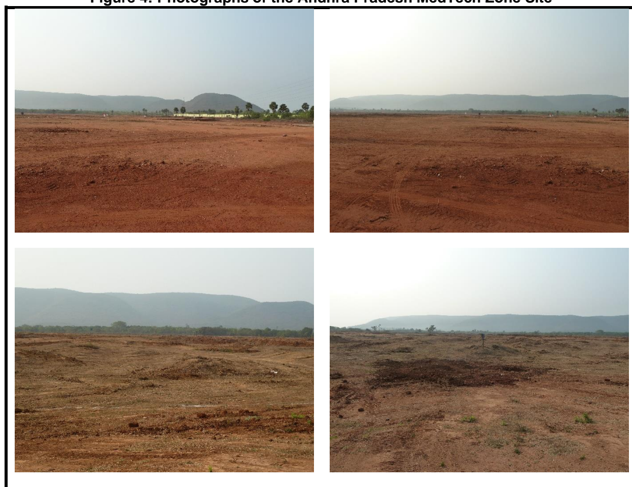
Figure 4: Photographs of the Andhra Pradesh MedTech Zone Site