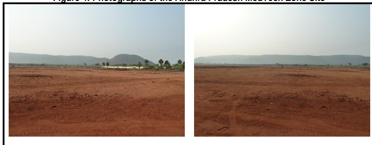
Figure 4: Photographs of the Andhra Pradesh MedTech Zone Site