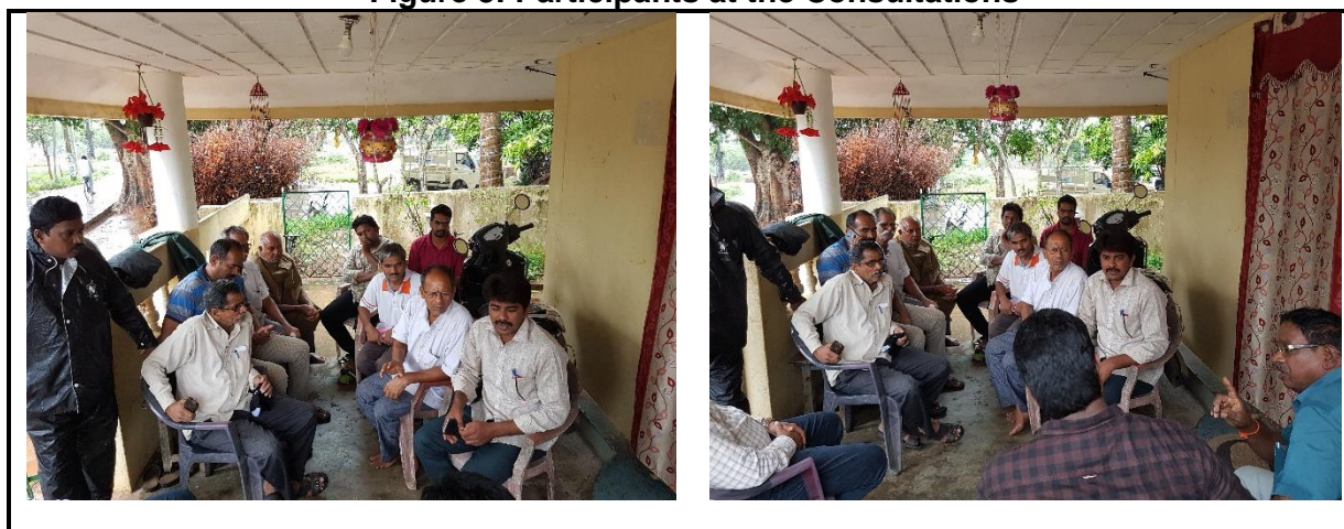
Figure 3: Participants at the Consultations

15. Discussions were held with the revenue officials and it was reported that about 168 encroachers/occupiers were identified and payments made to them at the rate of ₹1.2 million per acre by the District Collector based on the assessment made by the Commissioner, IALA and the report of the Tahsildar. It was also reported that the project area did not involve any private land or assigned land (D-patta).