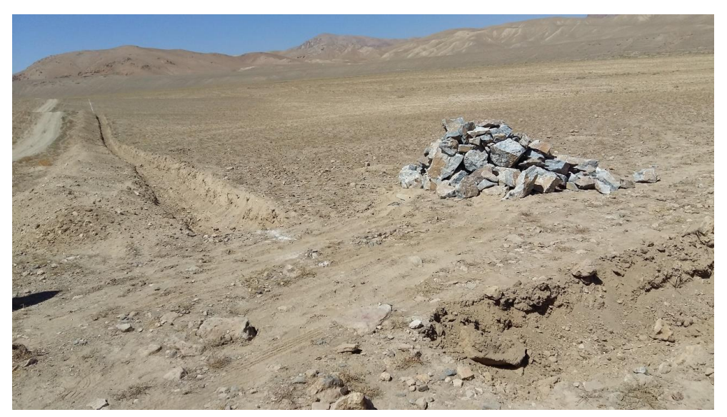
Figure 3-1: Plot for the future Bamyan Substation