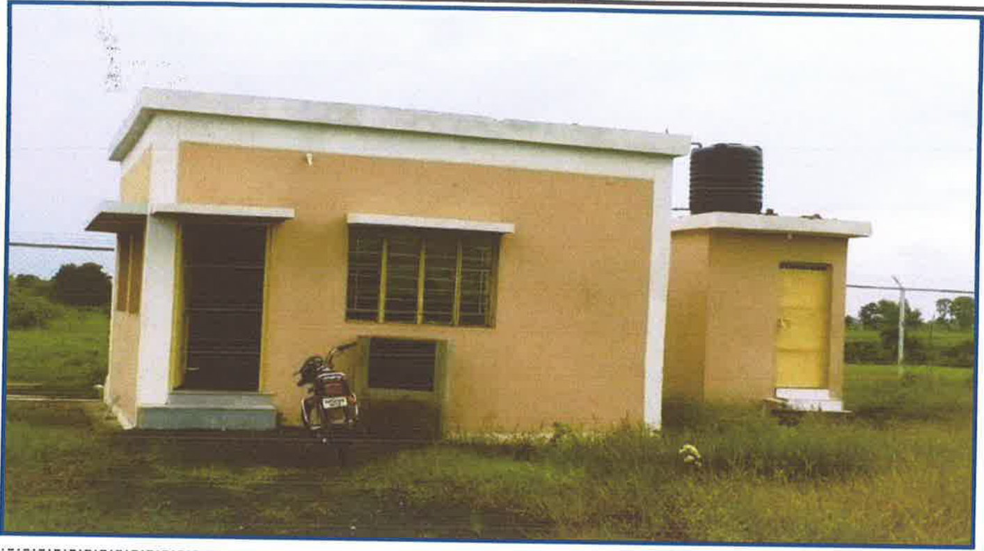
CONTOL ROOM AT 33/11 KV BELKHADU S/s AT JABALPUR