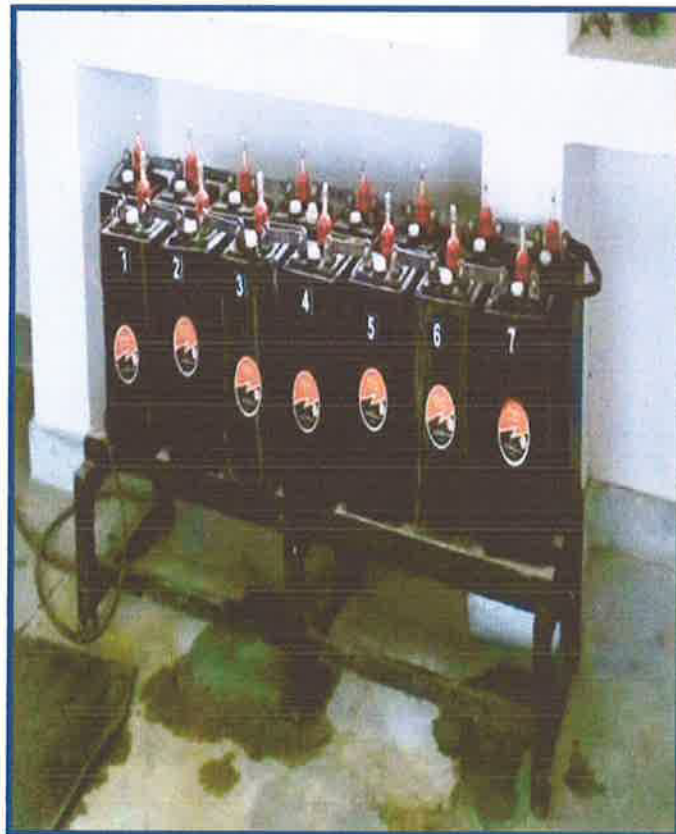
BATTERY BANK AT BIJNAWADA S/S AT CHHINDWARA