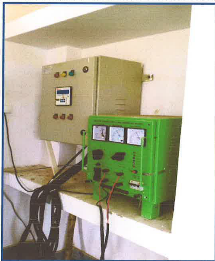
CONTROL PANEL & BATTERY CHARGER AT JIGNA S/s AT SATNA