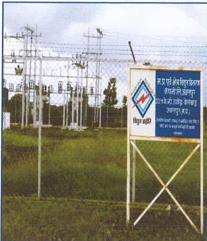
33/11KV BELKHADU S/S AT JABALPUR DISTRICT