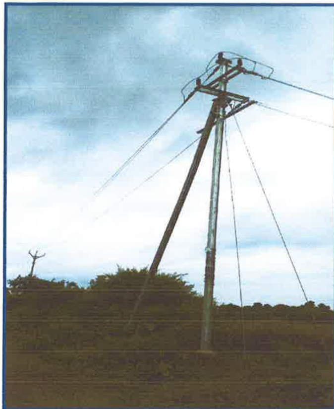
33KV BELKHADU FEEDER TO 33/11 BELKHADU S/S AT JABALPUR