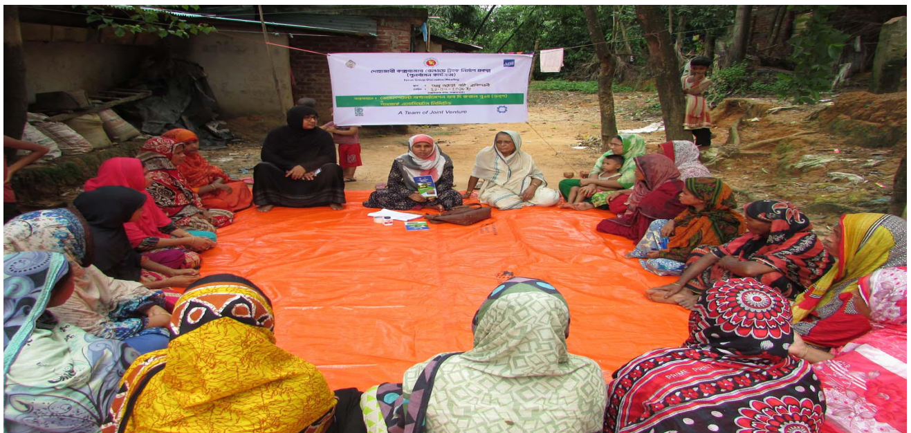
Focus Group Discussion for Vulnerable APs (Female Headed) at Koilaserghona, Napitkhali, Cox'sBazar Sadar Upazila, Cox'sBazar