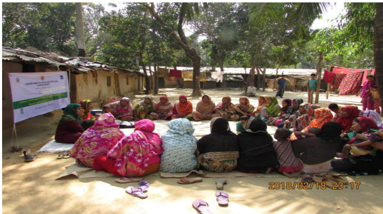
Focus Group Discussion for Vulnerable APs (Female Headed) at Dohazari Mouza of Chandanaish Upazila