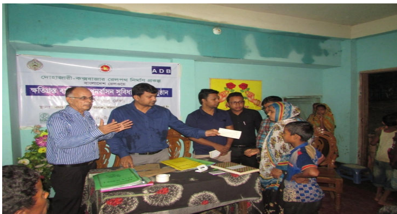
Cheque distribution to Vulnerable EPs at Jafar Alam Bari of Jhlongja Mouza of Cox'sBazar Sadar