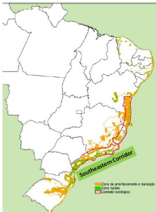
Figure 2 - The Southeast AF Corridor

Within RBMA, two ecological corridors have been designated, covering the length of current AF surface along the coast of Brazil: the Northeast and the Southeast AF corridors (see Figure 2). Yet, despite the designation, these corridors still face significant functional challenges, as illustrated by the Southeast corridor. One key challenge is the management effectiveness of protective areas, the other the lack of connectivity between the CU. Even though 25% of the AF habitat within this corridor is under some form of formal protection, the individual protected areas are not sufficiently connected with each other to guarantee the continuous biological corridor that is needed for the long-term viability of the AF ecosystem. At present, approximately 50% of the Southeast corridor remains in private hands, of which 25% is scattered among small farms and towns, rendering effective conservation considerably more challenging. Pressure on the remaining AF habitat is high and increasing. The major observed threats to this remaining area are: