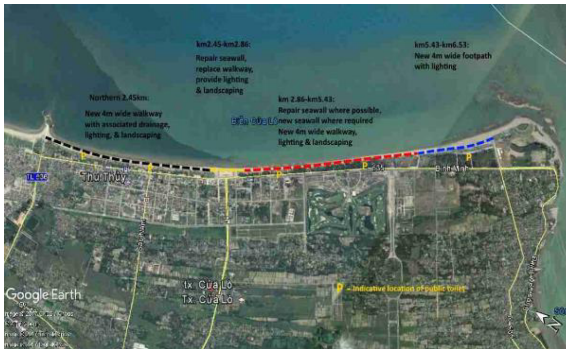
Figure 1: Concept Plan of Cua Lo Beachfront Access Improvements Subproject