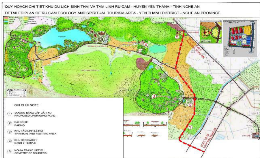
Figure 2: Layout plan of Ru Gam Pagoda Access Improvements Subproject