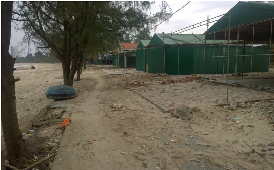
Cua Lo Beachfront Access Improvements Subproject