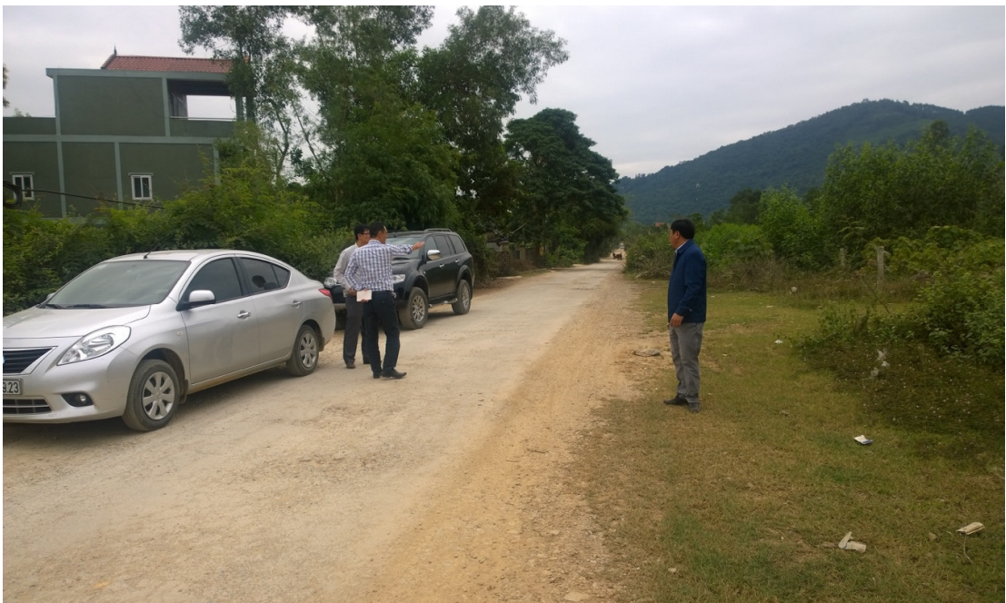
Ru Gam Pagoda Access Improvement Subproject