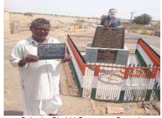
Subedar Shahid Gangaram Smarak km 90.00 of SH-66 (RHS)