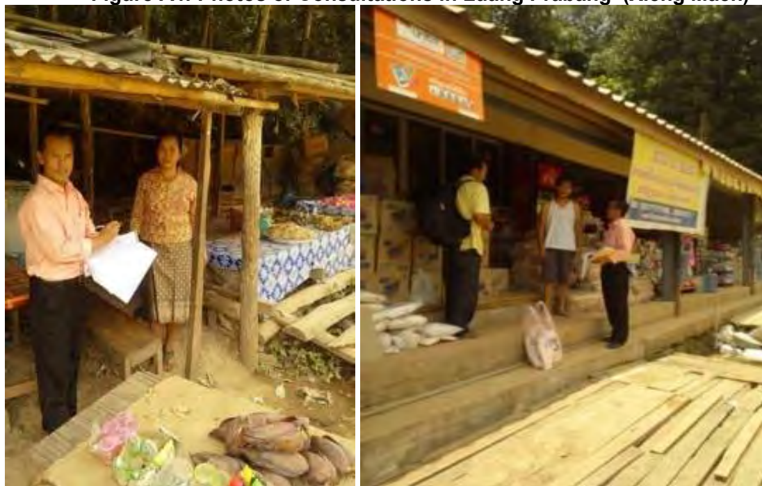
Figure A4: Photos of Consultations in Luang Prabang (Xieng Maen)