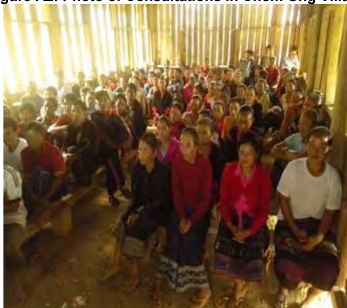
Figure A2: Photo of Consultations in Chom Ong Village