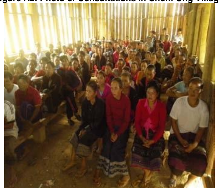
Figure A2: Photo of Consultations in Chom Ong Village