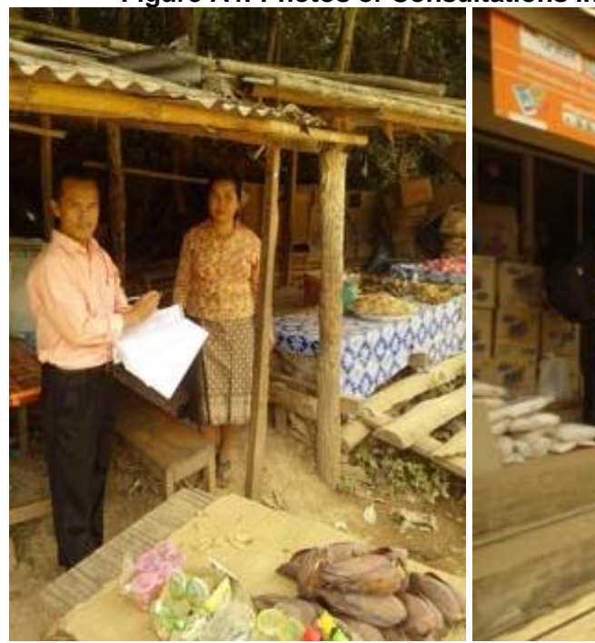
Figure A4: Photos of Consultations in Luang Prabang (Xieng Maen)