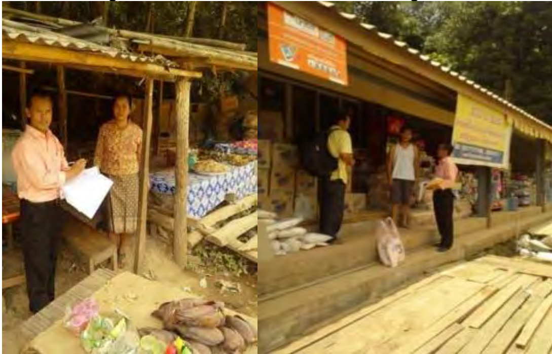
Figure A2.2: Photos of Consultations in Xieng Maen