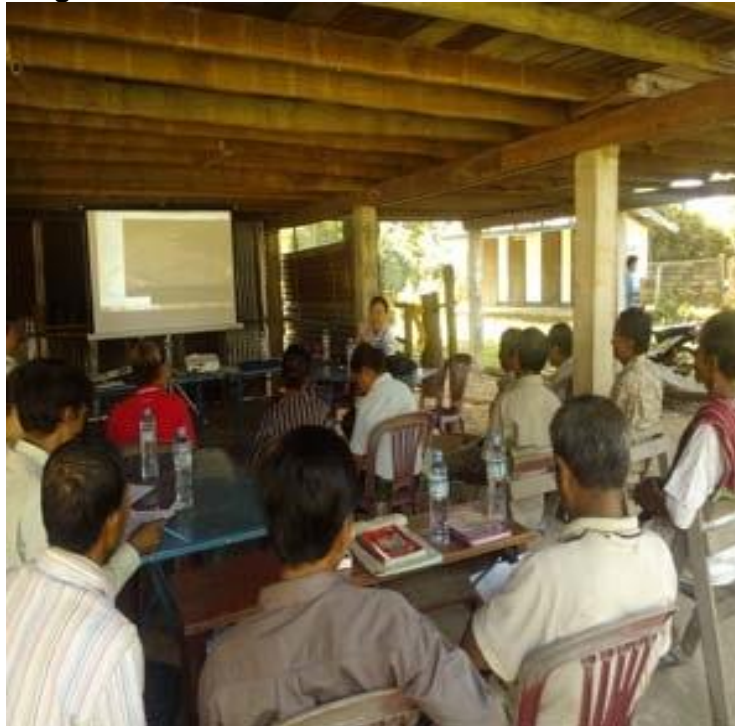
Figure A2.2 Photos of Consultations in Ban Tham