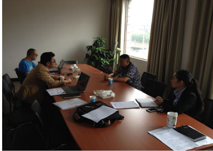
Picture 1-1 The resettlement monitoring team is discussing with related institutions