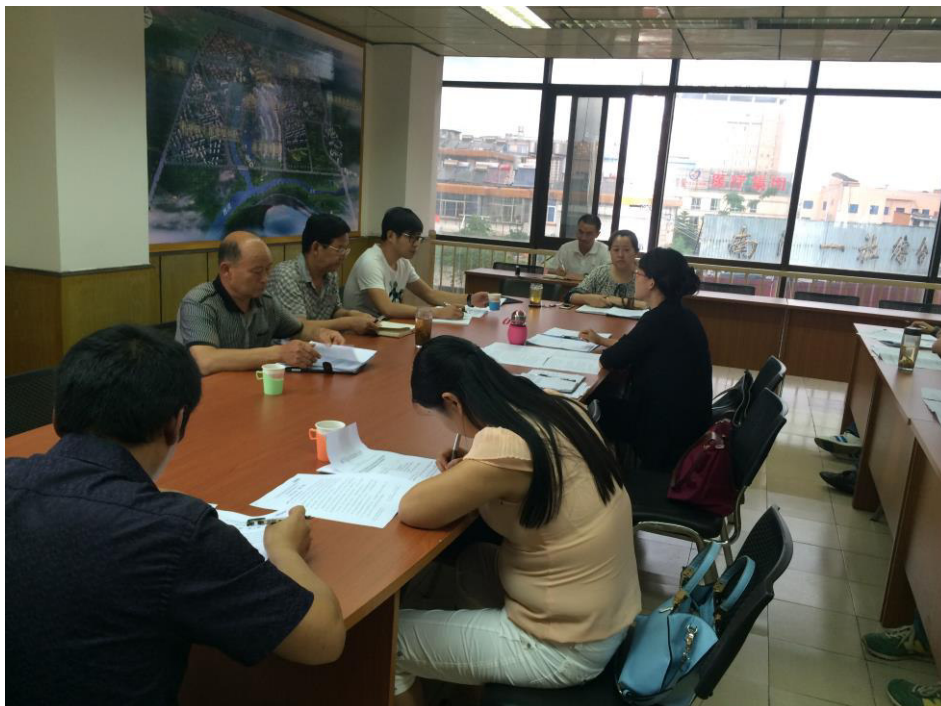
Picture 1-1 The resettlement monitoring team is discussing with related institutions

On June 21, 2016, the monitoring team arrived at Lufeng County affected by the Project to collect information for monitoring and evaluation. The team had fully learned the implementation progress of resettlement work there by ways of actively survey on public opinions and door-to-door interviewing with affected villagers, in addition to the informal discussion with leaders of the affected towns and villages. Thus, opinions of affected population on resettlement work are learned and sufficient communication is realized.