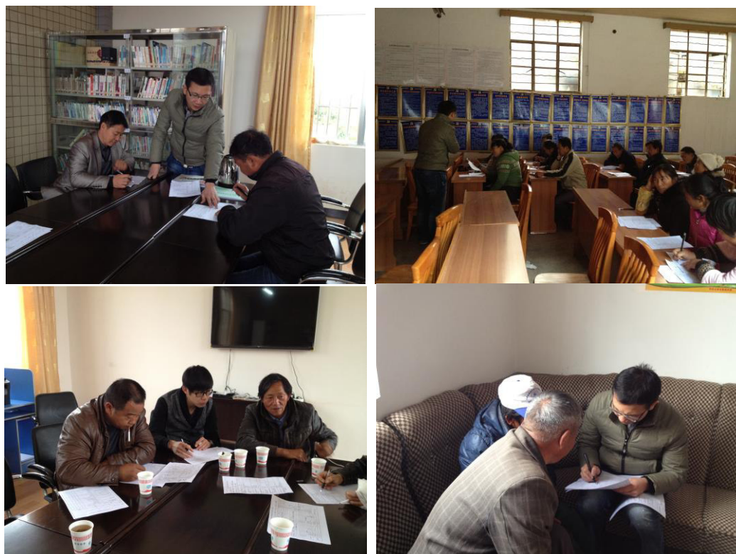
Figure 4-2 Public Participation and Public Survey

Statistical results of the sample survey show that generally, the informants acknowledge that the Project will bring positive effects to local traffic and living environment and benefit the state, the collective organization and individual residents; 78% of the informants support the Project. Although the Project is still in the preparatory stage, more than 66% local residents know it will be constructed here thanks to strong publicity. Meanwhile, local residents show their worry about the adverse impacts of land acquisition and demolition and they express their comments. See the following tables for results of the public survey.