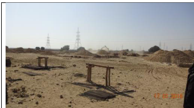
1.9 Dust pollution during digging due to sandy soil