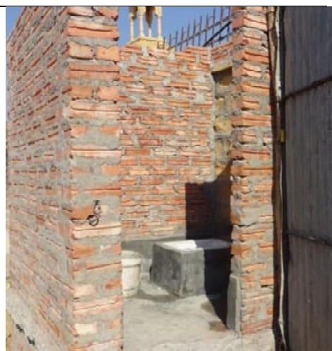
1.10 One toilet at the site