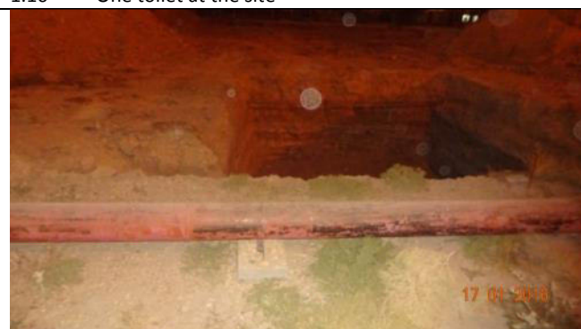
1.12 Foundation pit dug up at Akal Substation