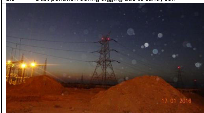
1.11 Augmentation at Akal Substation site