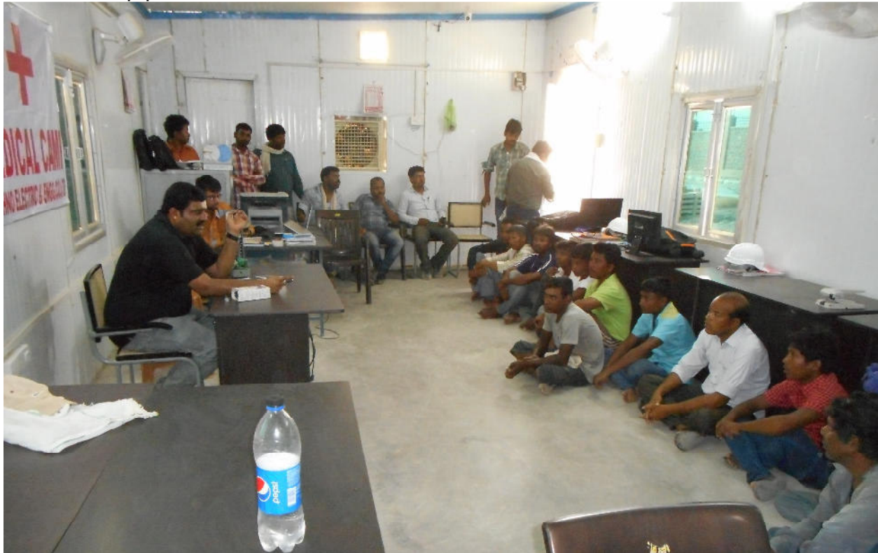
Medical camp pics:-