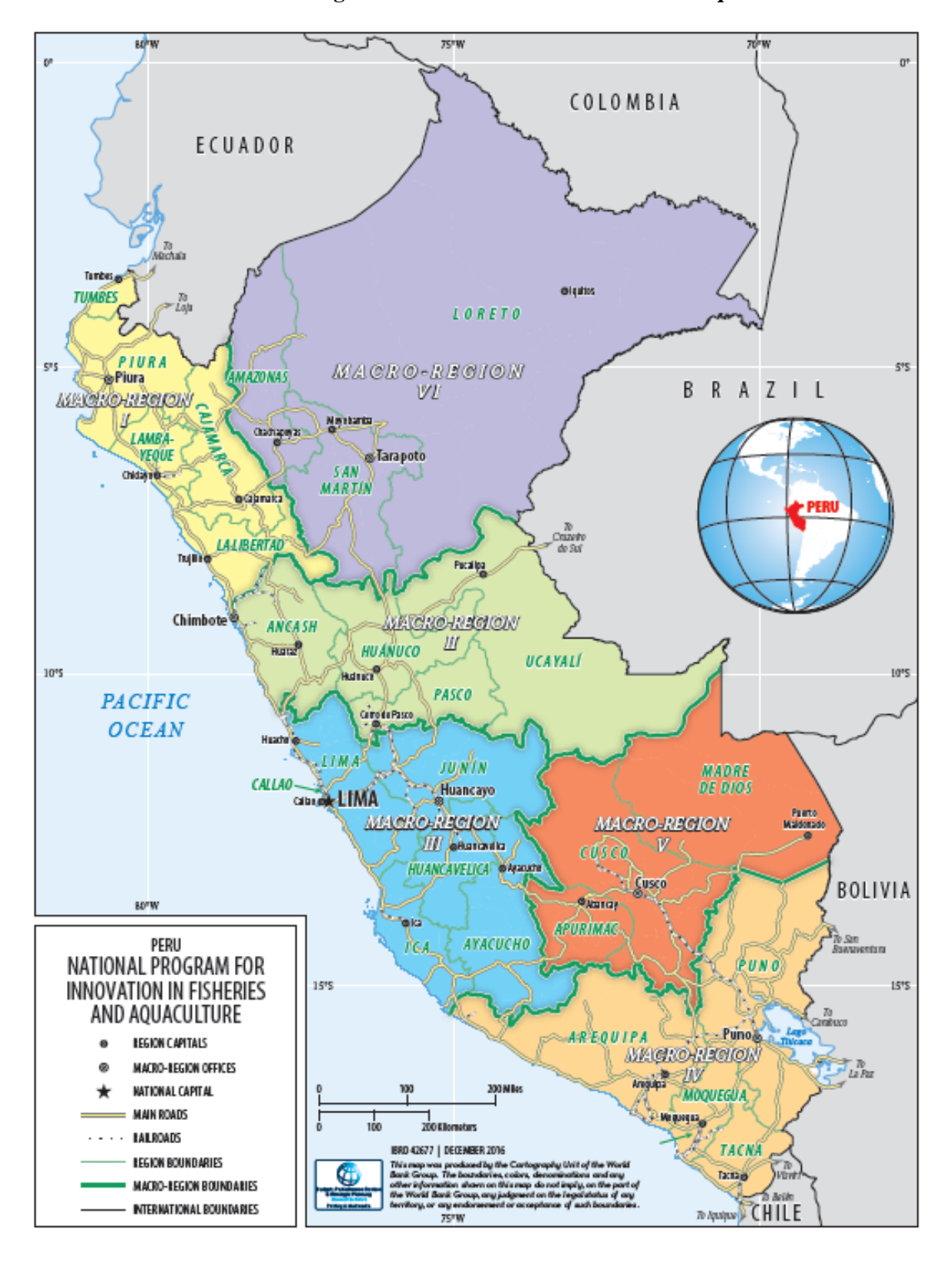
Annex 6: Map PERU: National Program for Innovation in Fisheries and Aquaculture