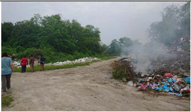
Existing IWMC location where the waste is burned