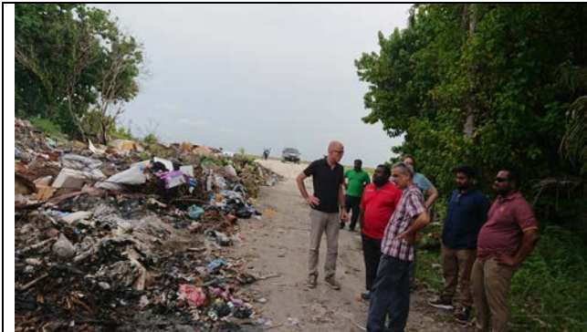
Existing dump site, disused IWMC