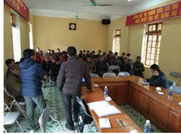
Public consultation in Mo Vang Commune