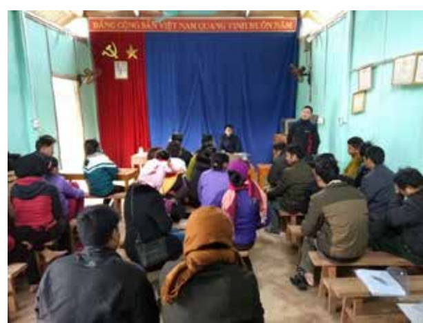
Public consultation in Dai Son Commune