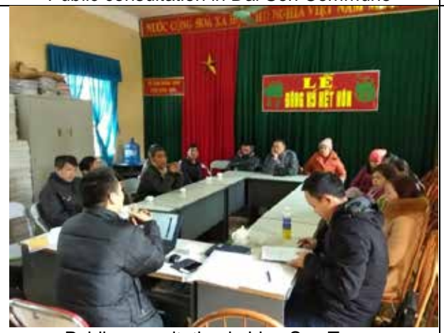
Public consultation in Lien Son Town