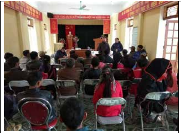
Public consultation in Mo Vang Commune