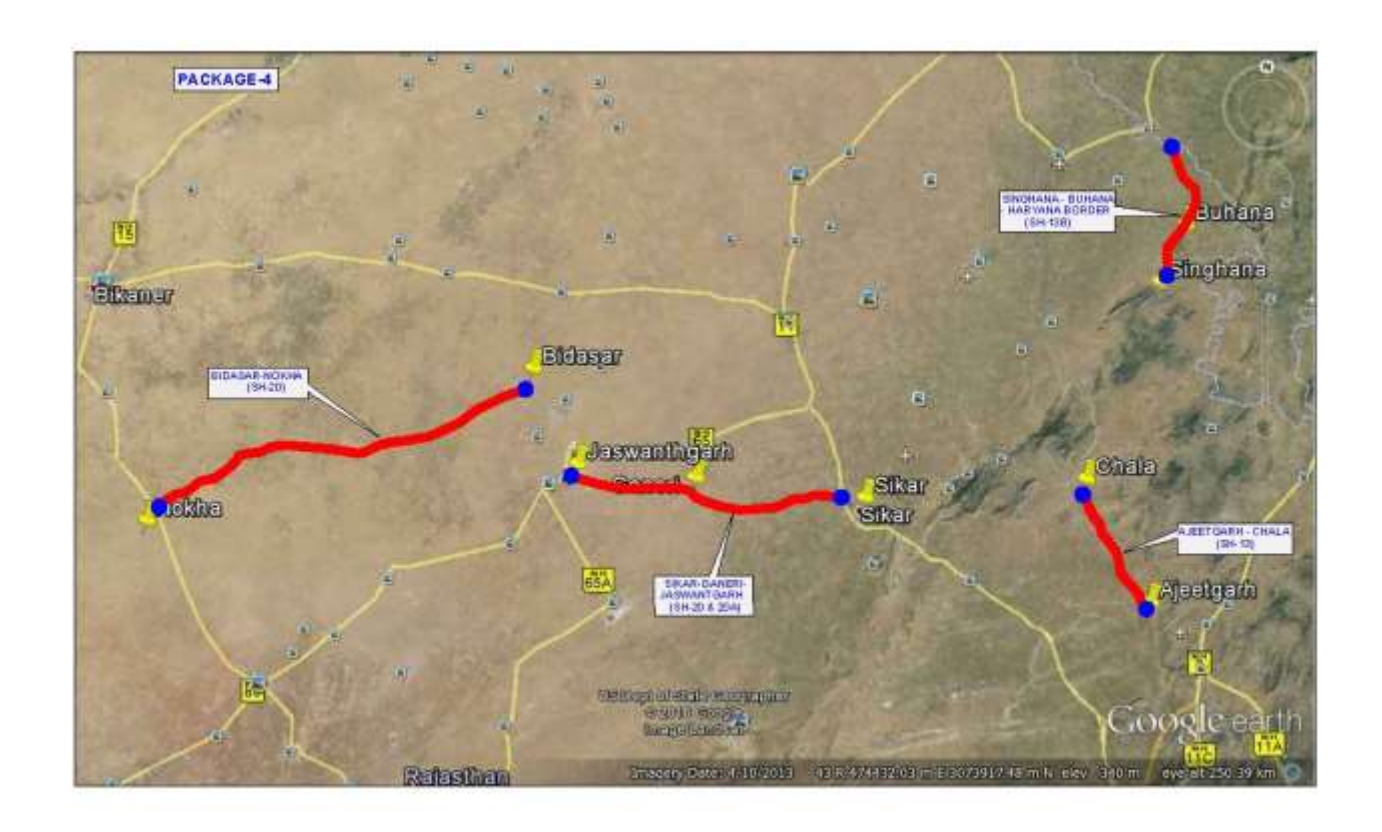
Appendix 1: Google Earth Image of the Subproject Road