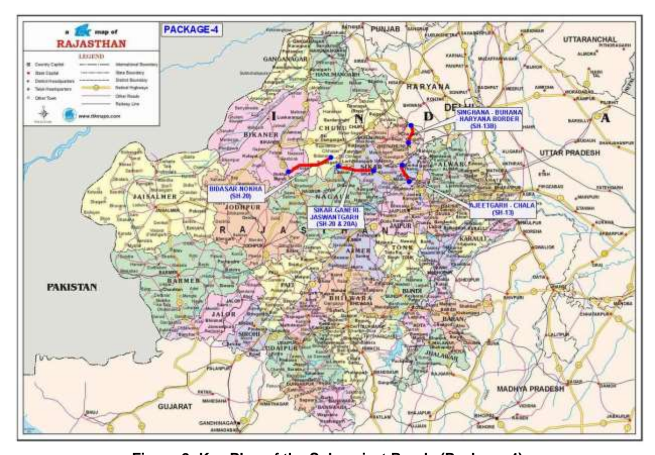
Figure 2: Key Plan of the Subproject Roads (Package-4)

12. Bikaner district is bounded by by Ganganagar District to the north, Hanumangarh District to the northeast, Churu District to the east, Nagaur District to the southeast, Jodhpur District to the south, Jaisalmer District to the southwest, and Punjab Province of Pakistan to the northwest. The district is situated between 27°11' and 29°03' north latitude and 71°54' and 74°12' east longitudes. Bikaner District has a population of 23,63,937 accounting for 3.4 percent of the State's population. Urban population accounts for 33.9 percent of the district's population and rural population is 66.1 percent. The percentage of male population (52.5%) is slightly higher than the percentage of female population (47.5%) and the sex ratio is 905, lower than the State average of 928. The literacy rate in the district is 54.1 percent, lower than the State literacy rate (55.8%) and the male literacy rate (63.1%) is higher than the female literacy rate (44.2%). There are 41.7 percent workers, of which main workers account for 76.3 percent and marginal workers 23.7 percent. Main workers comprise of 49.8 percent cultivators and 7.2 agricultural workers, totaling 57.0 percent dependent on agriculture. Other workers comprising service, industry, etc account for 40.4 percent of the main workers.