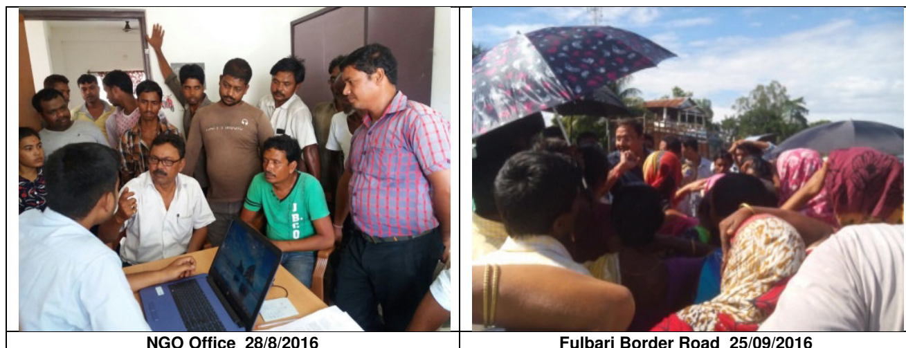
Figure 2: Public Consultations