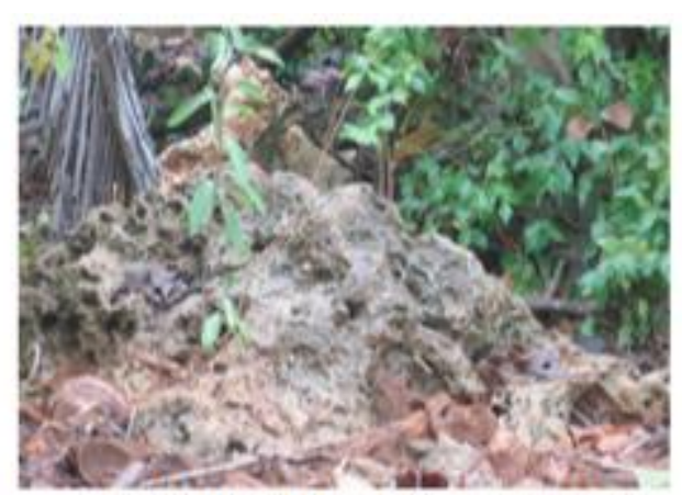
Makatea (typical coral limestone deposit) on proposed site in Mangaia Island