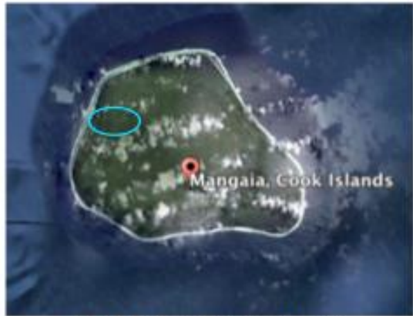
Figure 3: Location of Mangaia Solar Power Plant on the Island Map