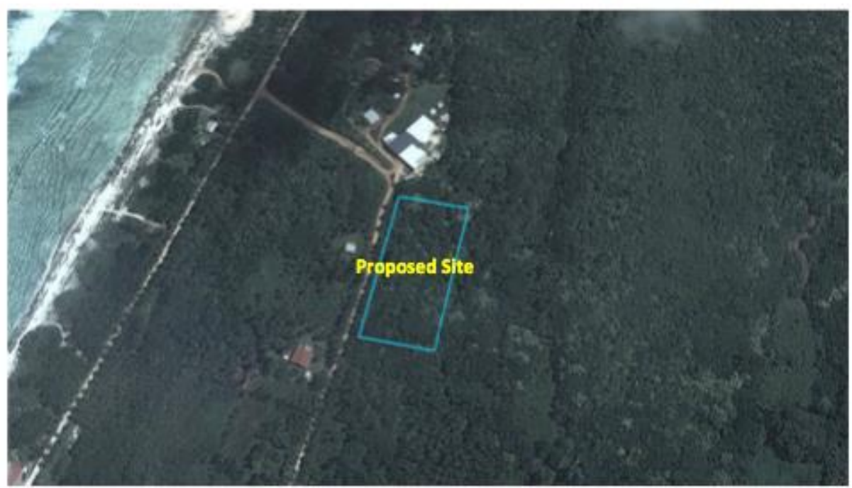
Figure 5c: Location map of the proposed site on Island Map of Mangaia Island