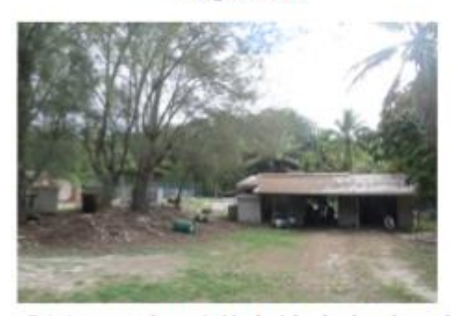
Existing power house in Mauke Island to be relocated to proposed solar power plant