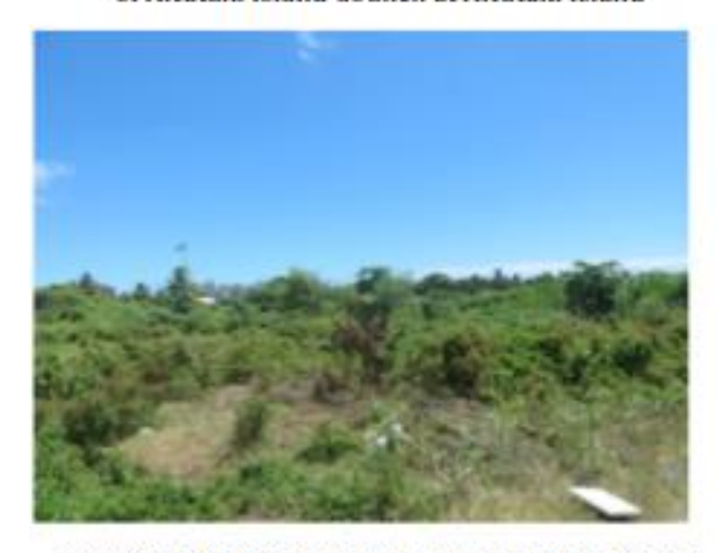
Vegetation (bushes) on proposed site in Rarotonga Island