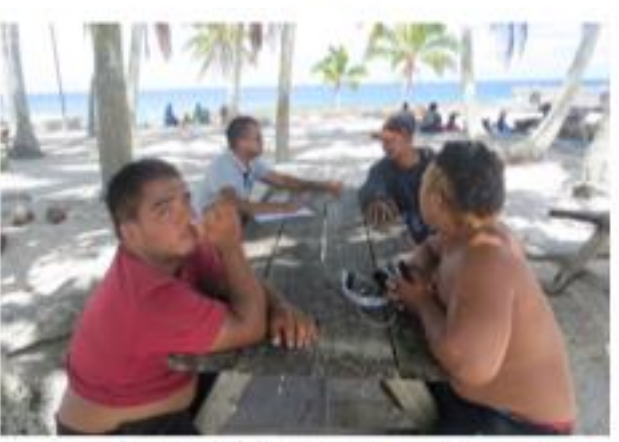
Consultation with local Communities Leaders in Mitiaro Island