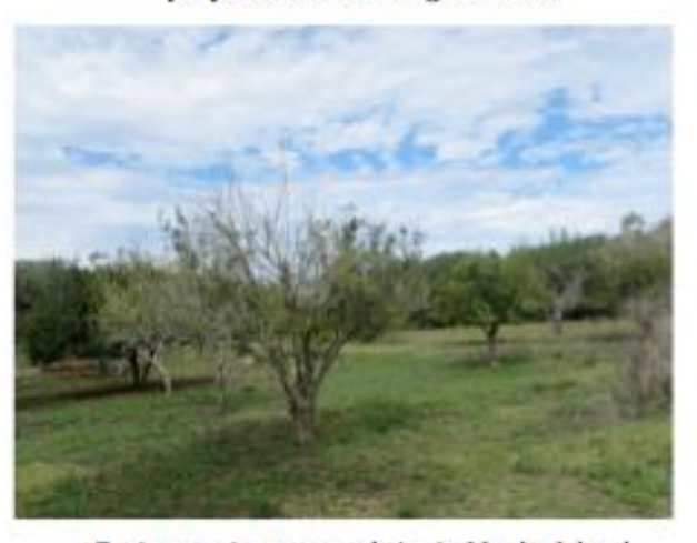
Fruit trees in proposed site in Mauke Island