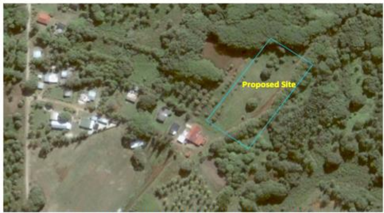
Figure 4c: Location map of the proposed site on Island Map of Mauuke Island