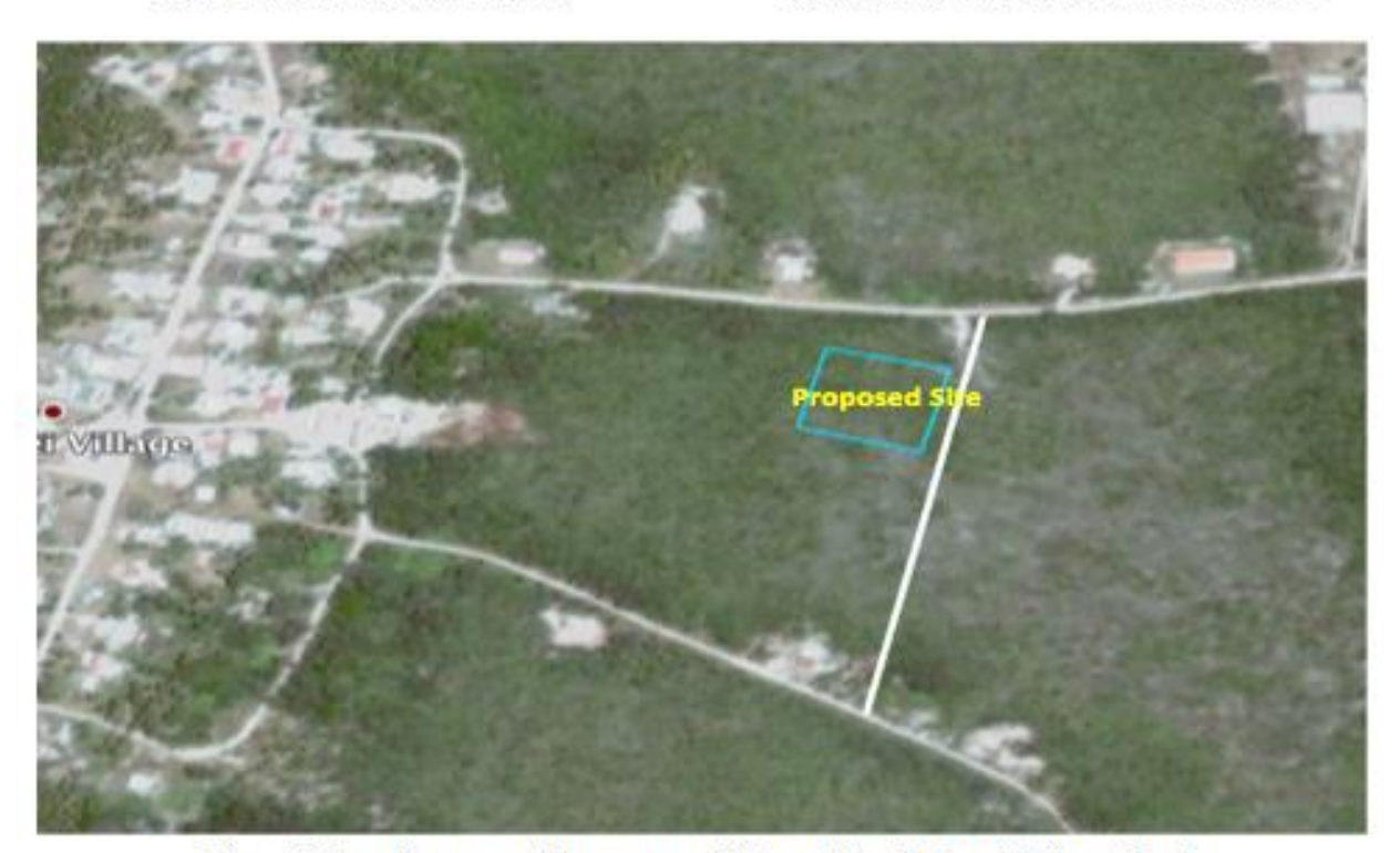
Figure 3c: Location map of the proposed sites on Island Map of Mitiaro Island