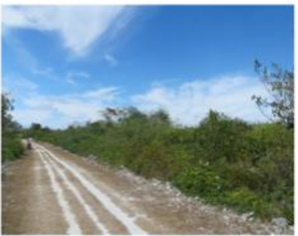
Figure 3b: Photograh of the Proposed Site