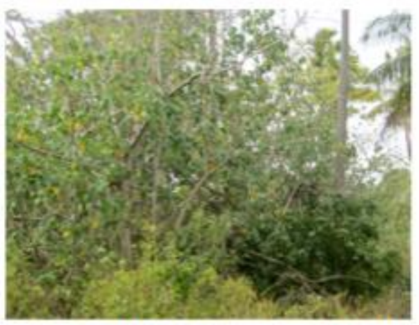
Invasive plants /vegetation on proposed site in Mangaia Island