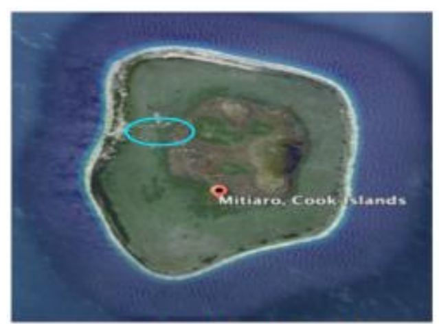
Figure 3a: Map of Mitiaro Island