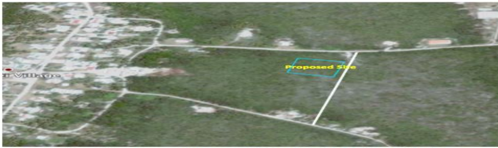
Figure 3c: Location map of the proposed sites on Island Map of Mitiaro Island