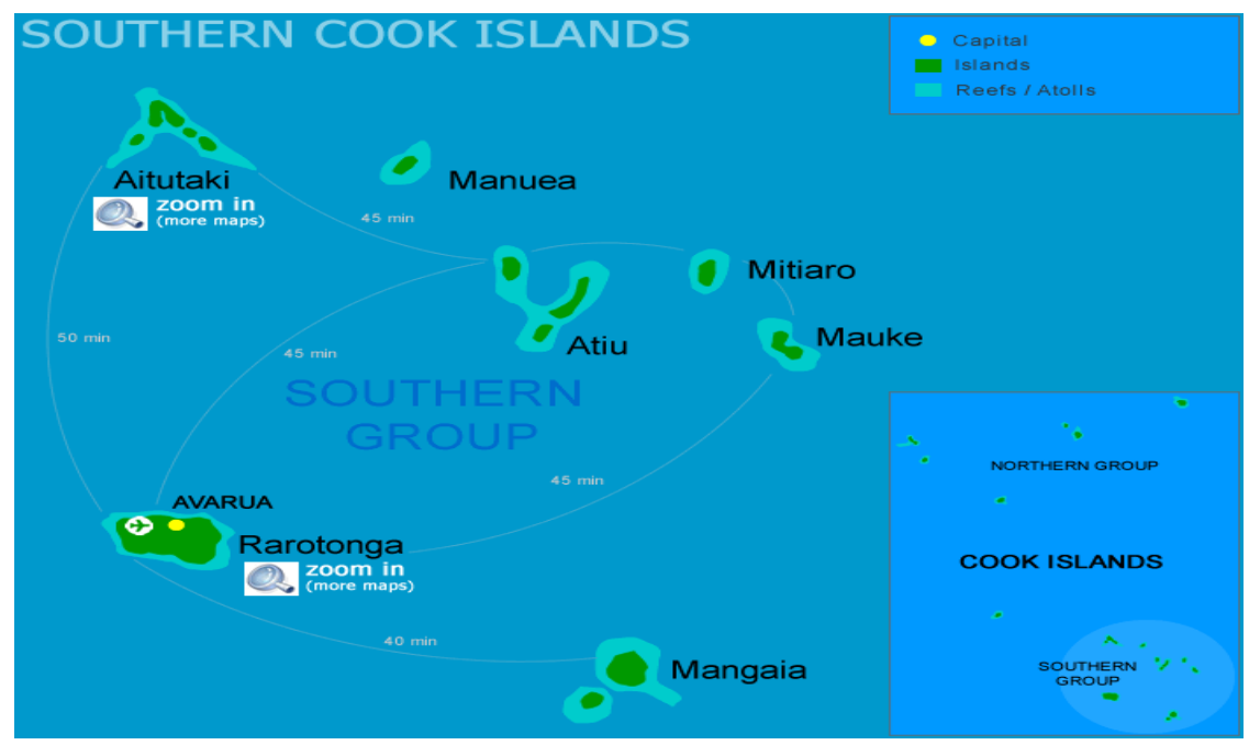
Figure 1. Location of Core Subproject Sites on Country Map<sup>5</sup>