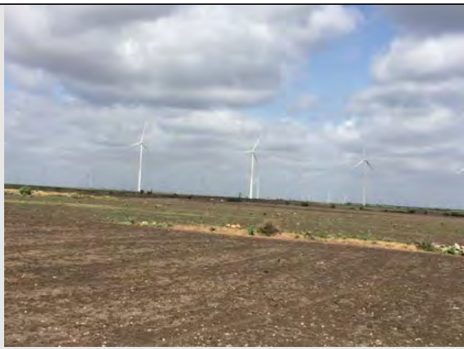
Site Locations of Commissioned WTGs