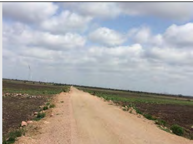
Approach Roads to the Project Site