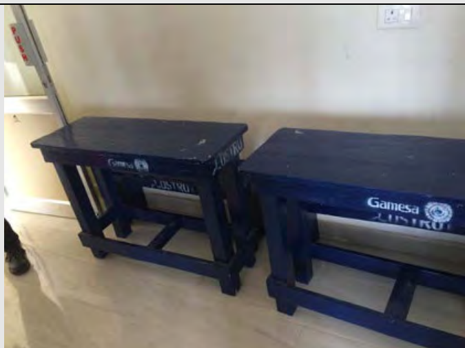
Furniture Re-fabricated from the Packaging Material Donated to the School as a Part of CSR Activity