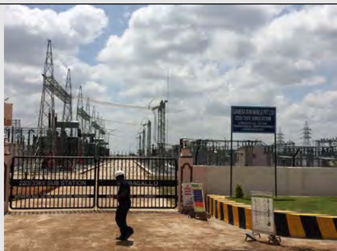
220/33 KV Pooling Sub Station at Nimbagallu