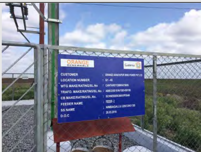
Close View of the Commissioned WTG