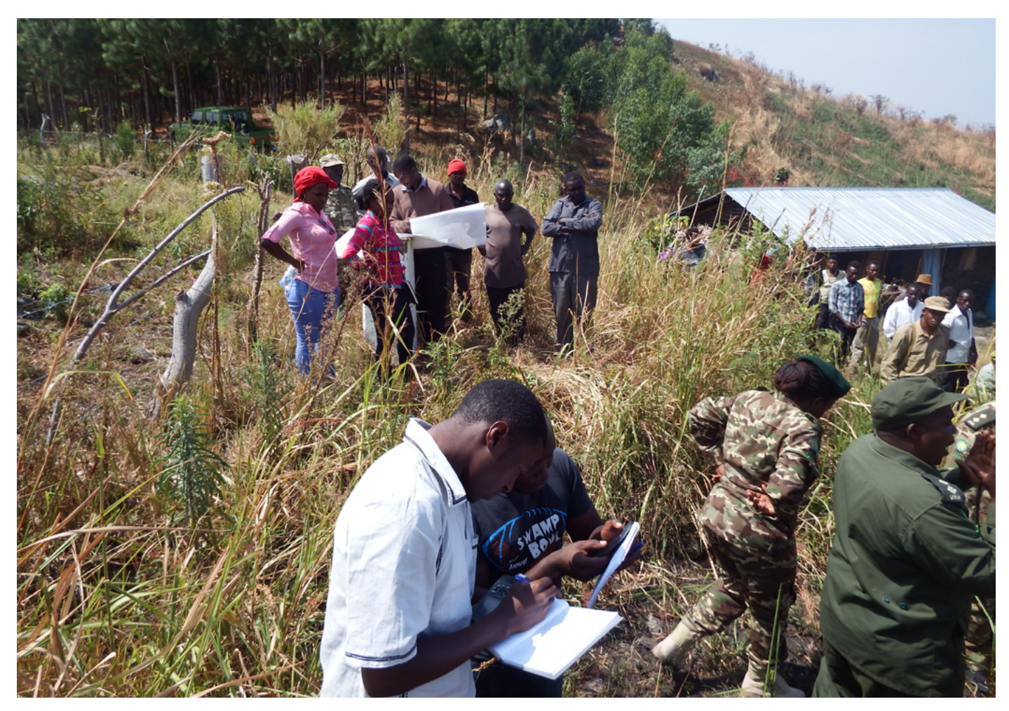
Members of the community living near the Toro Semliki Wildlife Reserve, Uganda.

In conclusion, this case shows that the World Bank failed to identify and mitigate the risks of reprisals. These risks would have been evident if the bank had properly consulted local communities before approving the project and if it carried out meaningful due diligence, including a review of the current litigation cases involving the project implementing agency. The bank also failed to assess the inability of the implementing agency (UWA) to conduct consultations with communities, given its history of systematic violence against Indigenous Peoples, and the general context of severe civic space restrictions in the country.