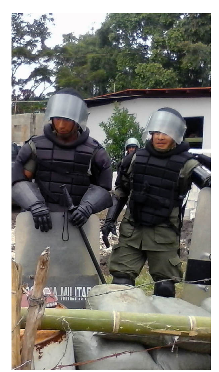
Police in Yichk'isis, Guatemala

Some DFI-funded projects involve the use of private or public security forces, though the extent of the use varies. Despite the risk that the deployment and presence of security forces increases the reprisal risk, the banks' documents do not provide a detailed analysis of these specific risks.