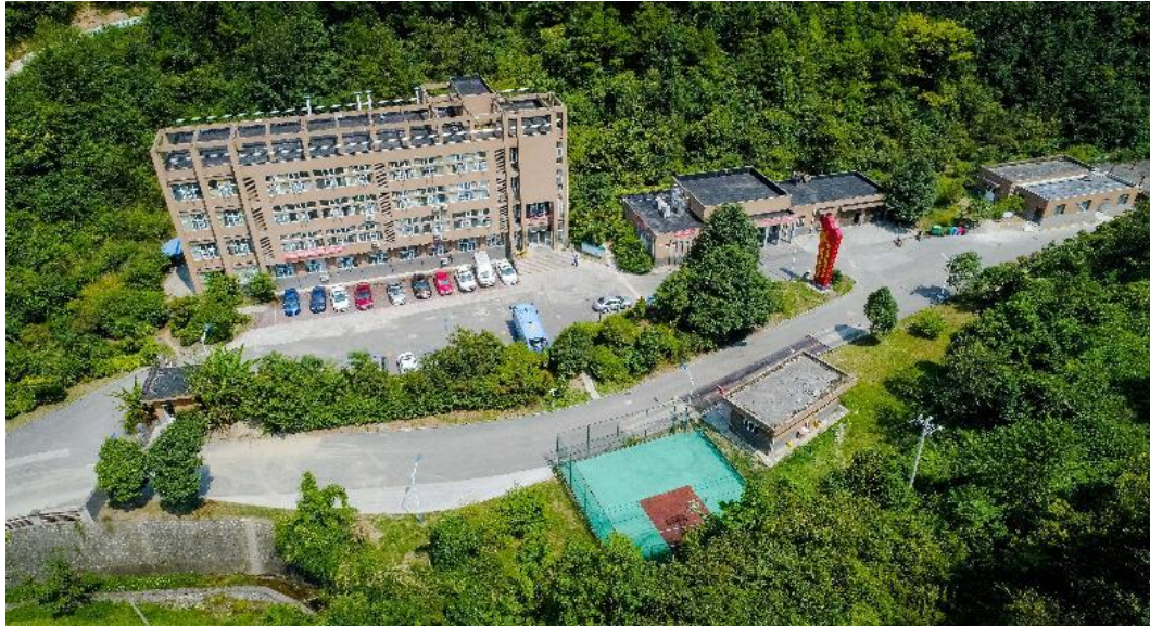
Fig 11-2 The status of GHWC