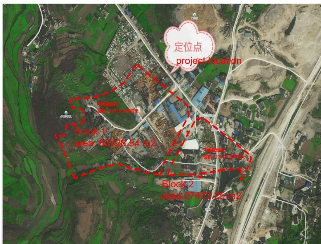
Fig 2 Project land acquisition and house demolition area

123. Among the three sub-projects, only Sub-project I (construction of GTC Medicine Hospital) involves land acquisition and house demolition, and the other two sub-projects do not require land acquisition. This RP has been prepared based on the project FSR and field investigations carried out by Wuhan University in Dec 2021 and Mar 2022. The project affects one village (Mainai village) in one town (Zhuchang Town). Due to the project construction, A land area of 204.01 mu are occupied, and 30,041.56m 2 of the buildings need to be demolished(see Table 1).