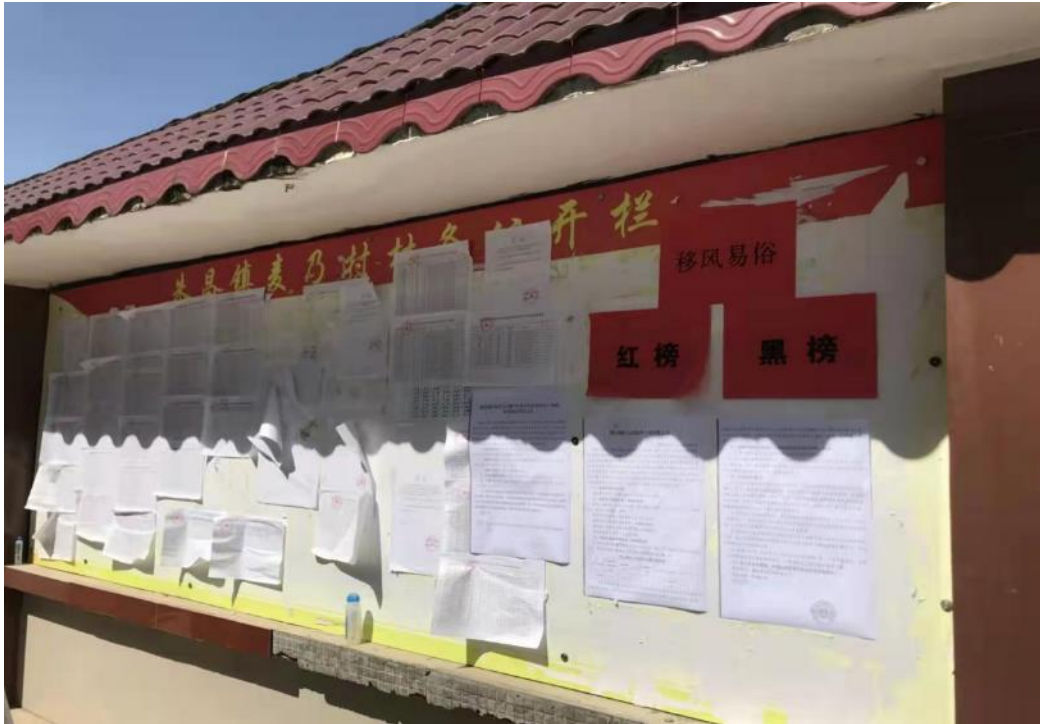
Figure 7-1 The information of LA and HD is publicized in the local community

3. Establish a complaint mechanism and channel for APs. The grassroots government of Guanshanhu District had collected the APs' complaints and appeals. To deal with APs' appeals in an objective, fair, efficient and timely manner, the governments had also builded a highly transparent and fair processing procedure for handling the complaints and appeals.