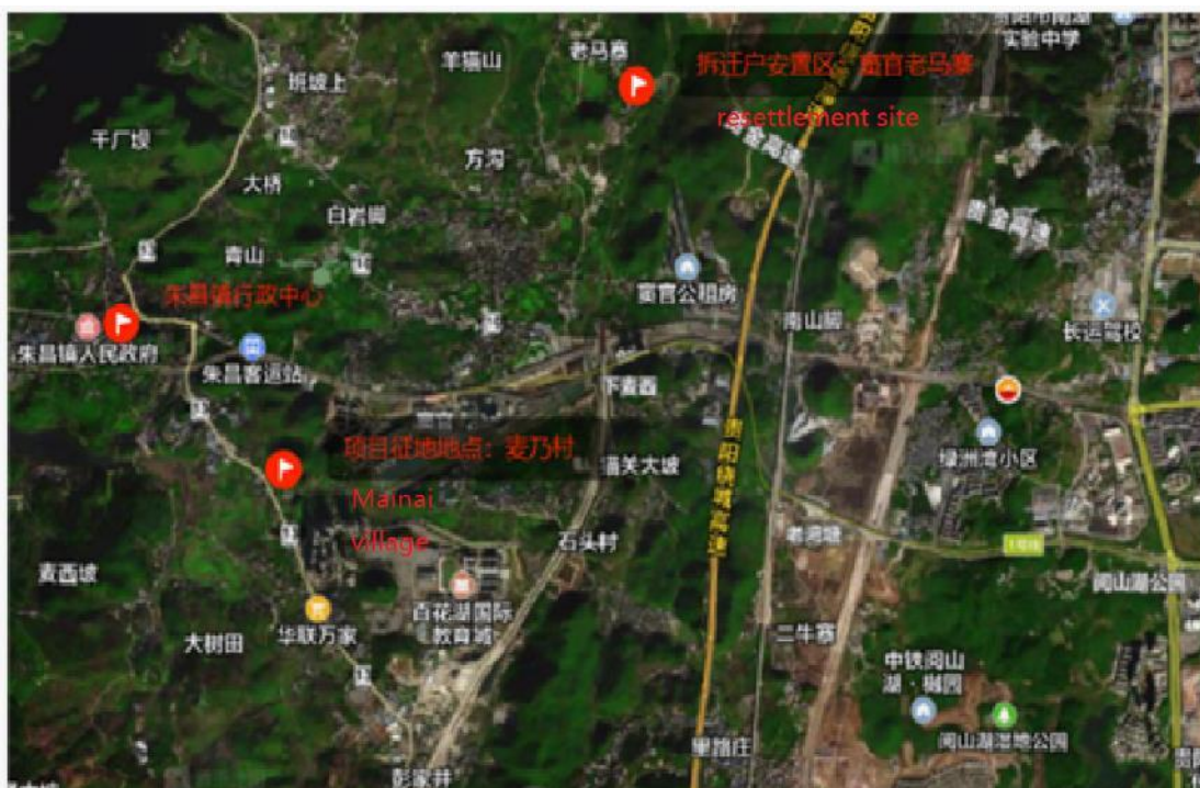
Fig 1 project scope

120. Guiyang Municipal People's Government with the support of ADB is committed to building a public health service system of traditional Chinese medicine in Guiyang. The project will promote the transformation of Guiyang's public health service system from "treatment-centered" to "health-centered" and provide a higher level of medical and health services for the growing population. The total investment in the project is 1.663 billion yuan, of which 110 million US dollars (about 700 million yuan) is loaned from the Asian Development Bank. The project is expected to start in October 2022 and be completed in October 2024, with a construction period of 2 years.