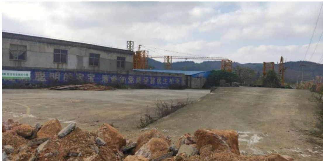
Fig 2-5 Demolished Warehouse

37. According to the survey, there are 6 warehouses and brick factories that were demolished in addition to housing. These affected buildings were used for storage and stacking of various equipment (see Figure 2-5). The total area of the buildings is 8,198.79m 2 , including 2,705.54m 2 of licensed buildings and 5,493.25m 2 of buildings that exceed the legal area (Table 2-7).