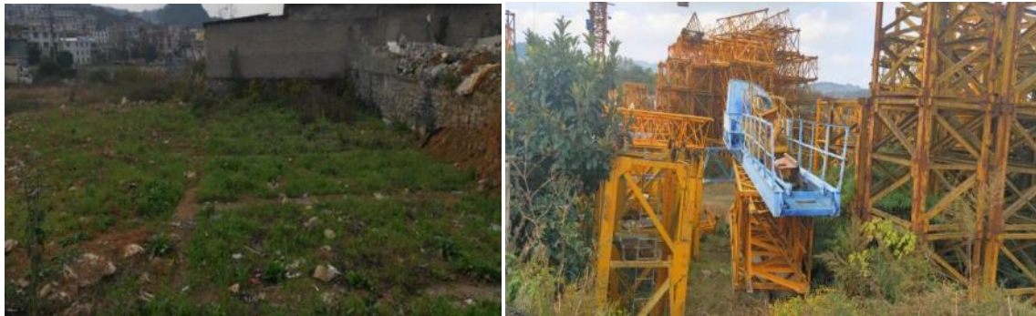
Fig 2-3 The Status of the Acquisition Land (before December 2021)

35. The acquired land has not been cultivated since 2019, and part of it has been used as storage by self-employed businessmen where various types of equipment and materials are stacked (see Figure 2-3). In 2021, after the land is adjusted by the natural resources and planning department for the construction of Guiyang Traditional Chinese Medicine Hospital, the project construction agency (Guiyang Communications Investment Group Development Co., Ltd.) had started to encircle and level the land in December 2021. At present, the land used for the construction of the traditional Chinese medicine hospital has been leveled and can be delivered to the project construction (Figure 2-4).