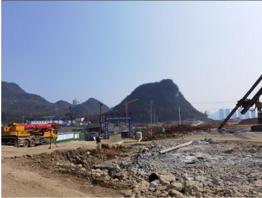
Fig 5-1 Current situation of Douguan Resettlement Site

resettlement site commenced in 2021 and it is expected to be completed by end 2023. The current situation of the Douguan resettlement site is as Fig 5-1. Based on the due diligence carried out, there are no outstanding resettlement issues (Appendix 1).