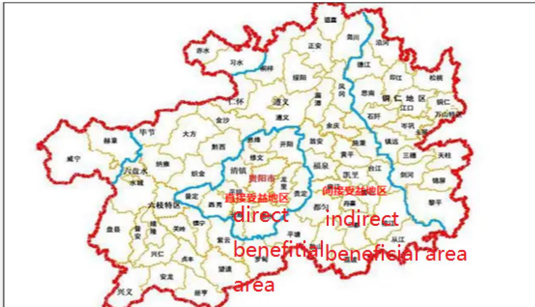
Fig 1-1 The Direct and Indirect Beneficiaries of the Project

22. The project will help integrate medical resources in the region, strengthen grass-roots public health services, enhance Guizhou's ability to deal with public health emergencies, and treat serious infectious diseases. The indirect beneficiaries of the project will radiate to the whole urban agglomeration in central Guizhou (27 million people) and Guizhou Province (38.5621 million people). The direct and indirect beneficiaries of the project are shown in Figure 1-1.