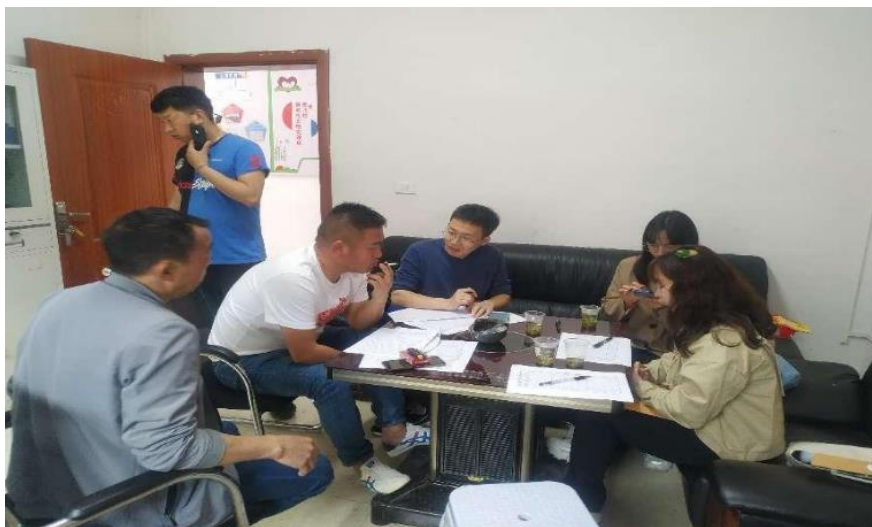
Fig 2-1 The field survey on the affected persons

32. In March 2022, after the project construction plan and land use scope were determined, Wuhan University conducted a field survey on 28 affected households (of which, 20 HHs are affected by house demolition) to learn detailed information about compensation standards, resettlement methods, resettlement progress of land acquisition and house demolition, and to collect the affected persons' opinions towards the project construction (see Figure 2-1). The field investigation provides public consultation channels for the affected persons and collects valuable data and information for the Resettlement Plan preparation.