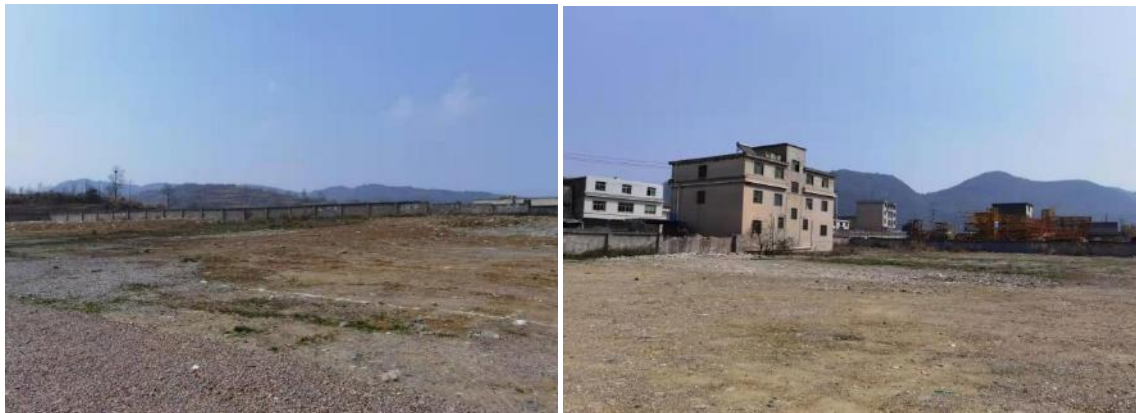
Fig 2-4 The Status of the Leveled Acquisition Land (March 2022)