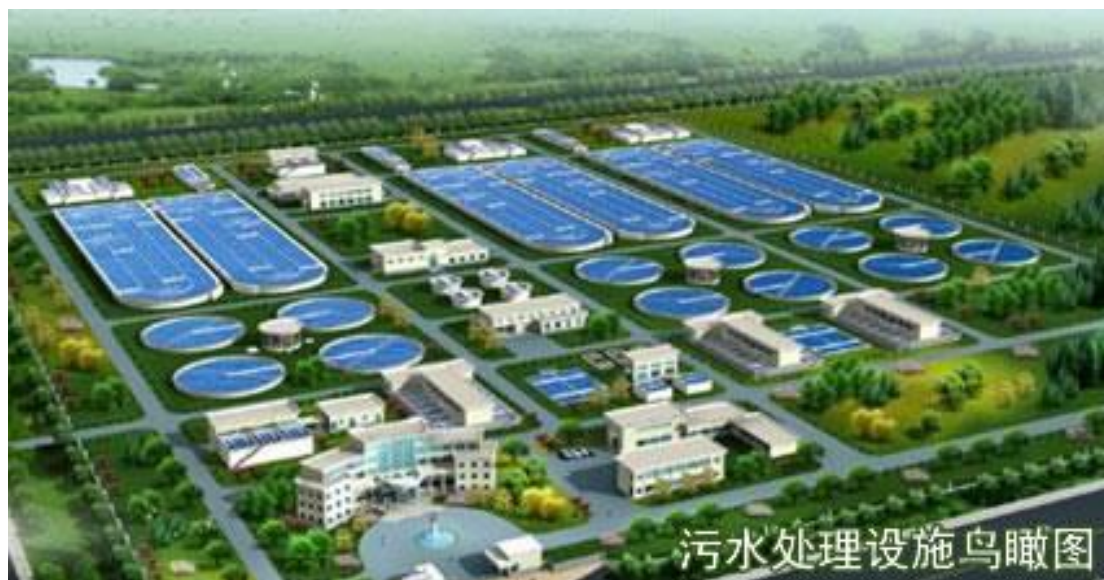
Fig 10-1 Aerial View of GJSTP

112. GJSTP is located in Ganchong Community, Changchong Village, Zhuchang Town, Guanshanhu District. The design scale of the sewage plant is 15,000 cubic meters per day, and the project investment is nearly 174.9283 million yuan. According to the plan, GJSTP will serve about 170,000 people in the near term and 730,000 in the long term (see Figure 10-1). The land acquisition for the project was implemented in 2015. The sewage plant was constructed in 2016. In 2018, the project's first phase was completed and started operation.