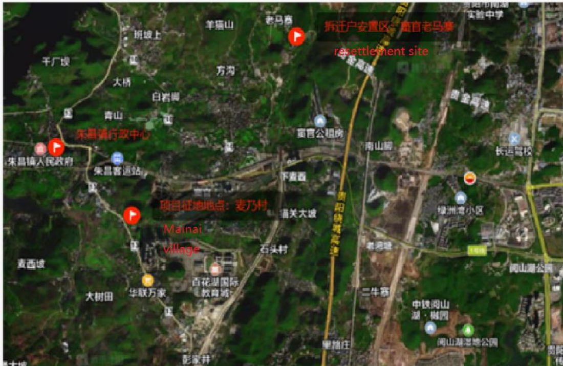
Fig 1-2 The Directly Affected area of the Project