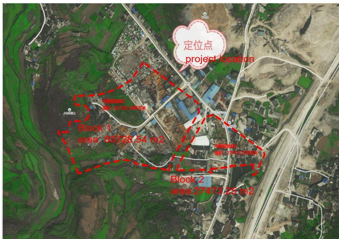
Fig 1-3 Project land acquisition and house demolition area

25. From 2015 to 2020, the built-up area of Guanshanhu District increased from 60 square kilometers to 81 square kilometers and is expected to reach 100 square kilometers in 2025. From 2015 to 2020, the population of Guanshanhu District increased from 210,000 to 642,600, the urban population increased from 106,700 to 547,500, and the urbanization rate increased rapidly from 50.81% to 85.19% (see Table 1-2). It is expected that the resident population will reach 750,000 and the urbanization rate will reach 90% by 2025.