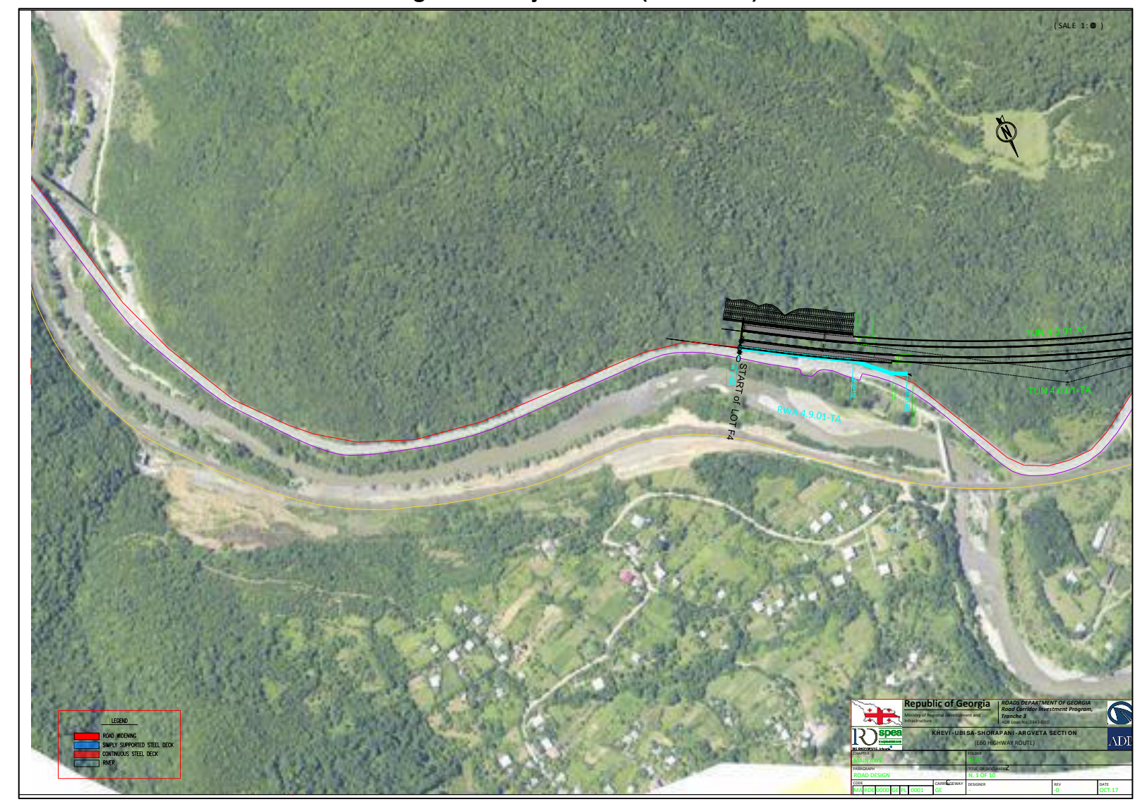
Figure 5: Project Road (KM0 – 0.6)