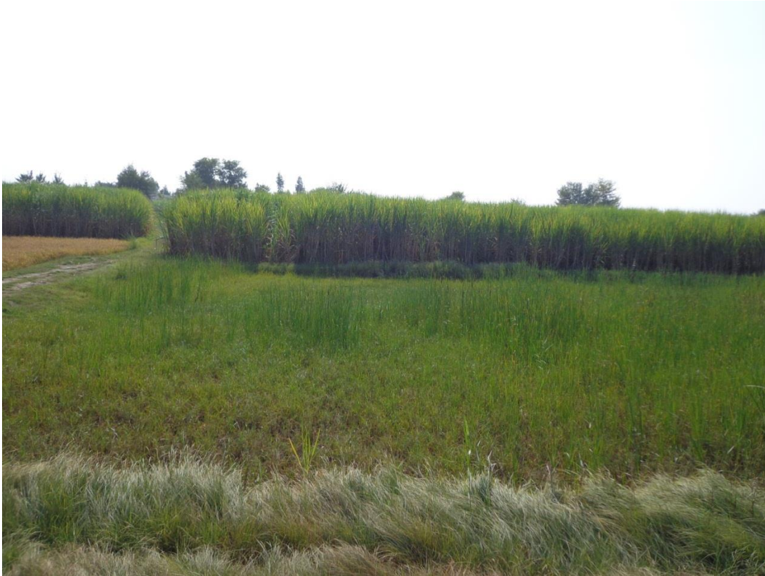
Figure-4: Sugarcane Fields – major Crop of the Project Area