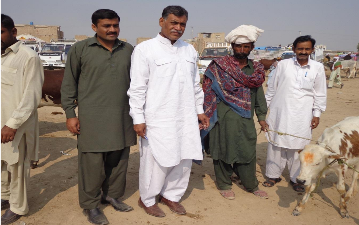
Figure-5: A way side Consultation at Jampur