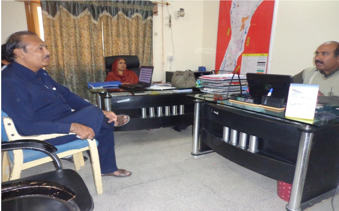
Figure-2: Meeting in the Office of SYCOPE NGO Muzaffargarh