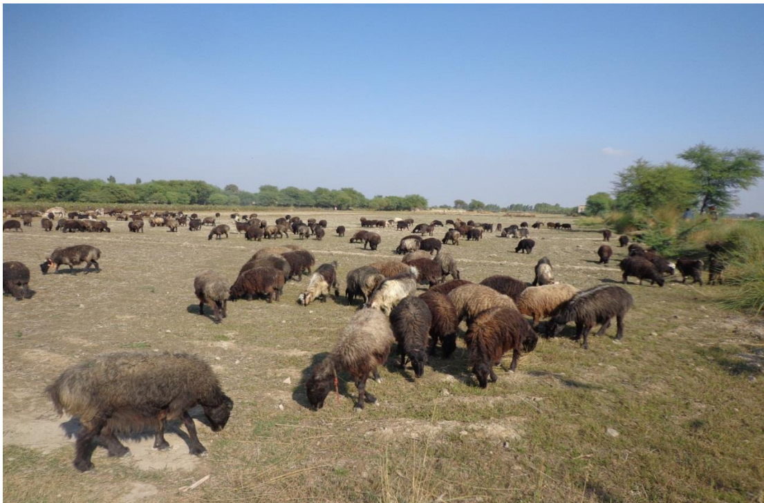
Figure-3: Livestock Rearing along the Project Corridor – a Significant Livelihood Source of the Area