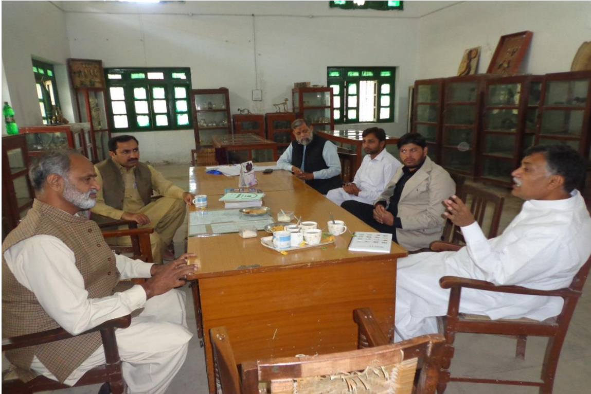
Figure-1: A Consultative Session with the Professors of Govt. Post Graduate College Muzaffargarh regarding Flora and Fauna of TL Route