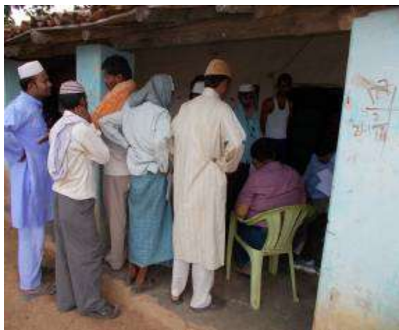
Public Consultation: Village Parsouna