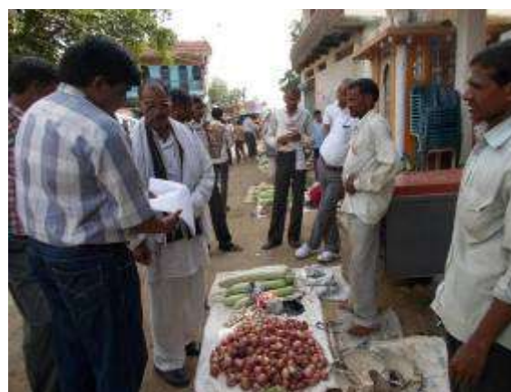
Public Consultation with vendors in village Sarai