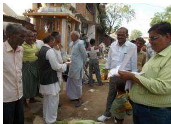
Public Consultation with vendors in village Sarai