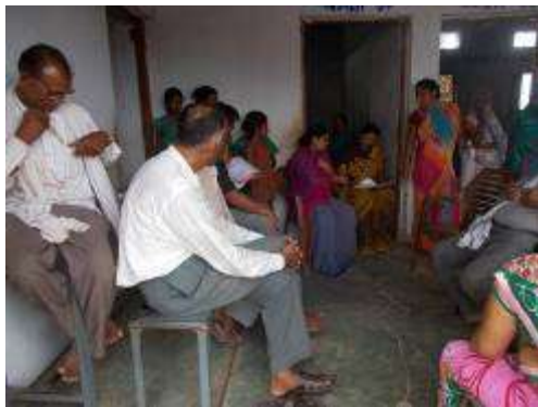
Public Consultation: Village Jawa