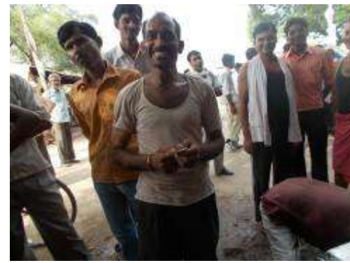
Public Consultation: Village Attarela