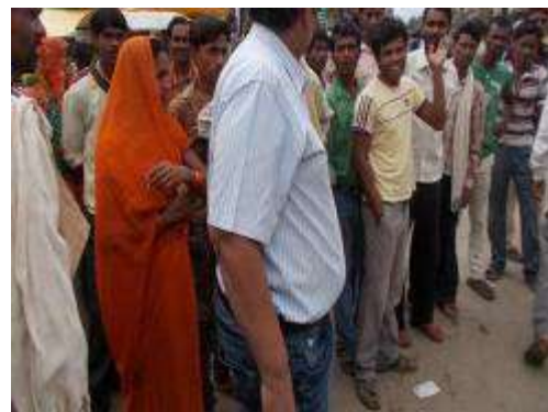
Public Consultation: Village Rangoli