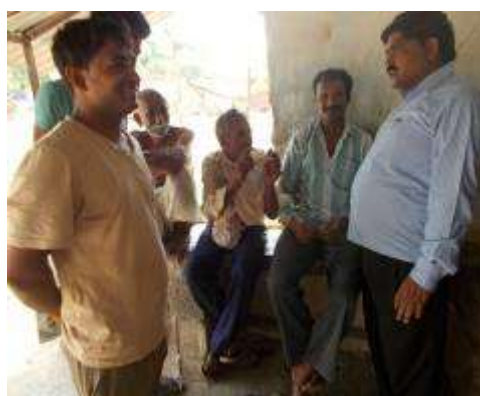
Public consultation: Village Bidwah