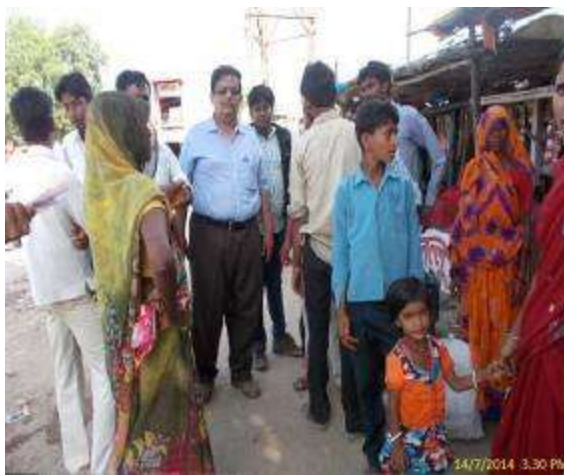
Public Consultation: Village Rajmilan