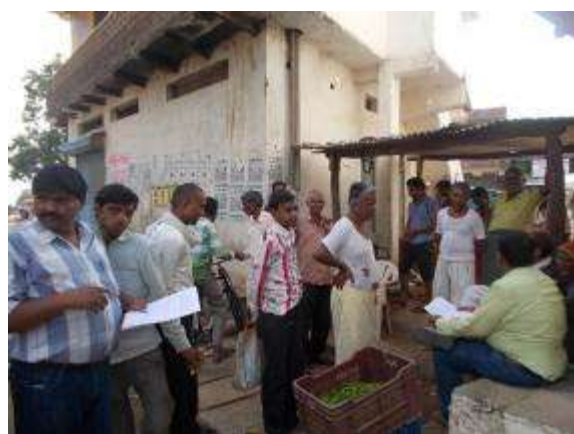
Public Consultation with vendors in village Sarai