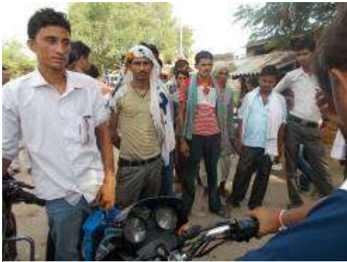
Public Consultation: Village Bakiya