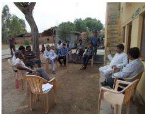
Public Consultation: Village Bakiya