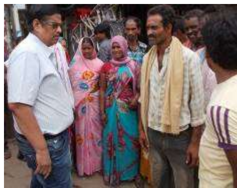
Public Consultation: Village Simariya