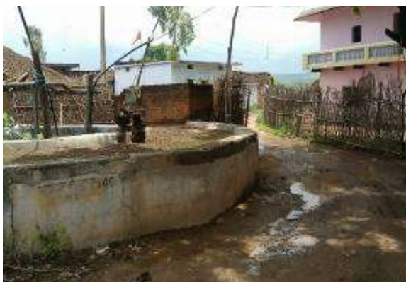
Likely affected residential structures, lands and community well in village Deokhar

16. Since MPRDC agree to provide bypass in village Deokhar to avoid partial impact on residential structure, lands and community well and not to consider built up area of Jawa, Chilla and Chakghat, than there are no permanent or partial impact on any asset or temporary disruption of livelihood, it is decided to prepare a due diligence report for this section of road. The Project falls in category C, therefore no resettlement plan is required as there is no private land acquisition or acquisition of other assets. There is no displacement of people and there is no loss of permanent income is caused by sub project. Table A.1 details the findings.