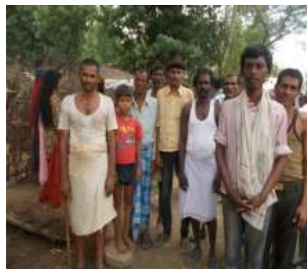
Public Consultation: Village Bankuiya