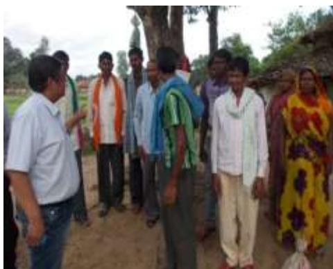
Public Consultation: Village Paipkhaira