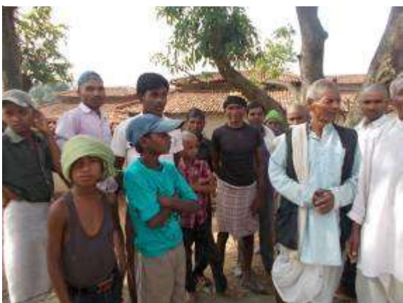
Public Consultation: Village Kachhara