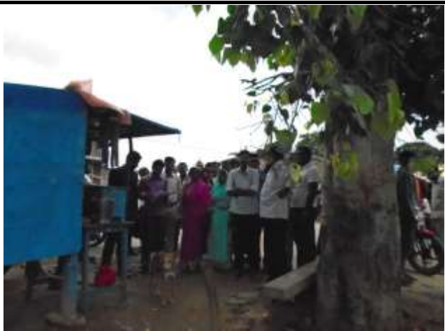
Public Consultation at Tikri