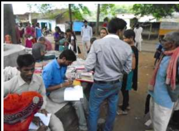
Public Consultation at Barambaba Village