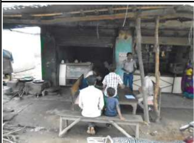
Public Consultation at Tikri