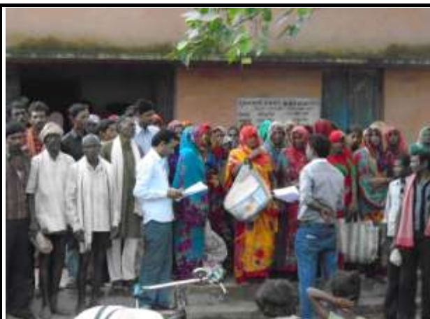
Public Consultation at Barambaba Village