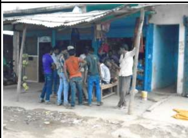
Public Consultation at Dol Village