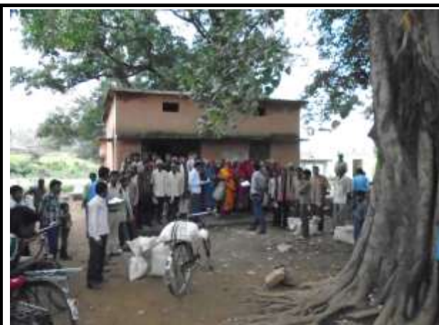
Public Consultation at Barambaba Village