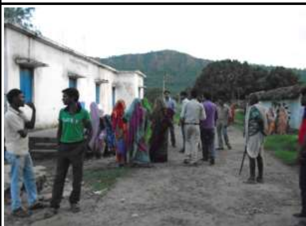
Public Consultation at Gandhi-Gram Village