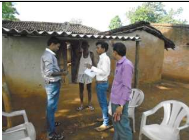
Public Consultation at Rampur Village