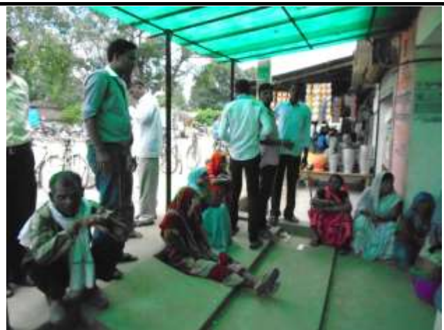
Public Consultation at Tikri