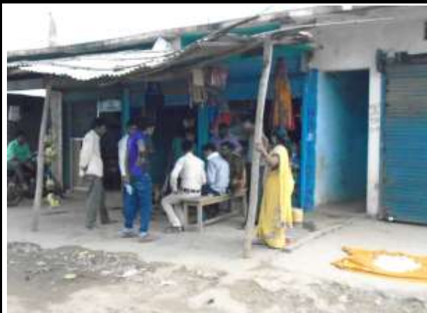
Public Consultation at Dol Village