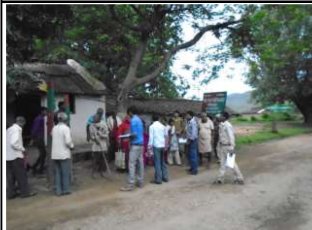
Public Consultation at Rampur Village