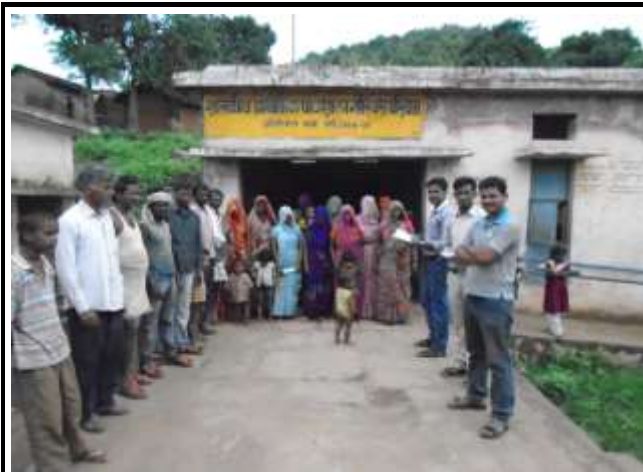
Public Consultation at Goriyara-Paschim Village