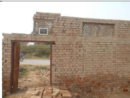
T-11 : Muhammad Riaz