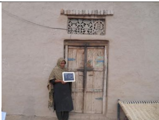
T-18 : Zafra Bibi