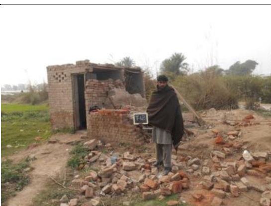
T-12 : Umar Draz