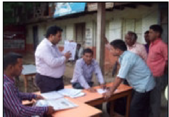
Public consultation at Gauchar