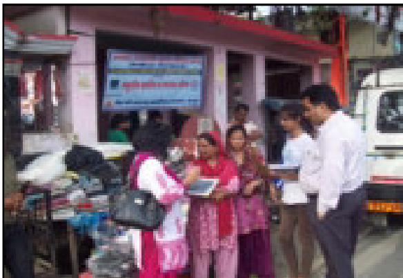
Public Consultation at Gauchar Main Market Area