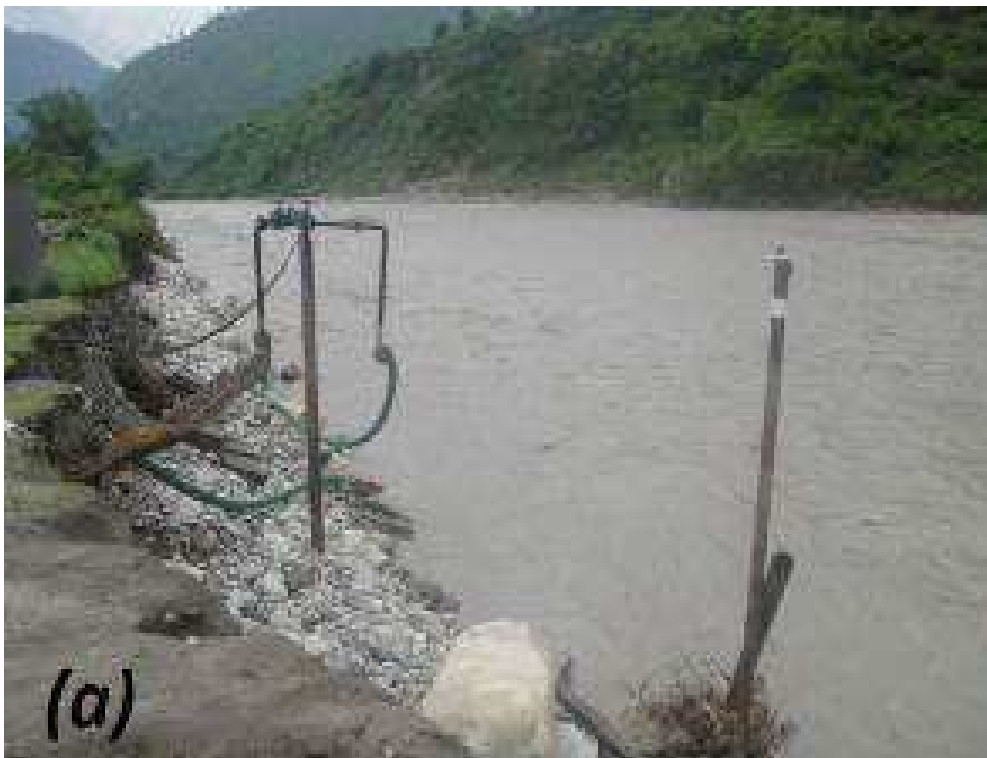
RBF Site Damaged Due to Flood