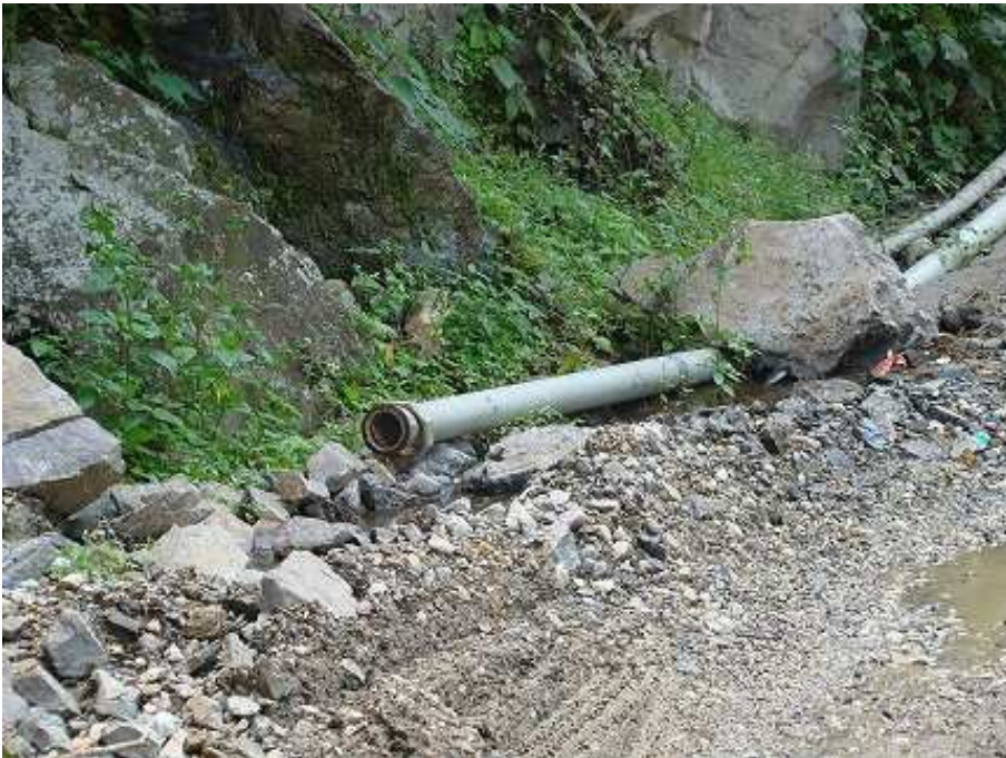
Karnprayag water pipeline broken on road side due to heavy rain fall