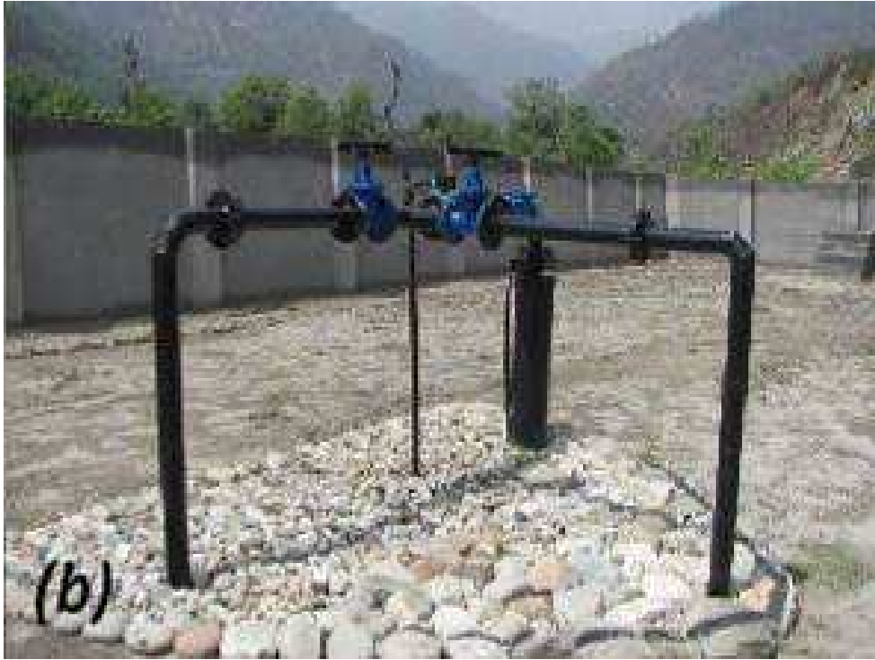
RBF Site before damage