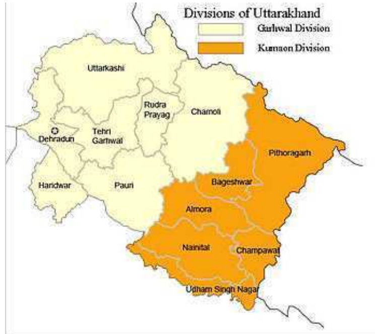
Districts of Uttarakhand

is comprised of 13 districts, these are; Pithoragarh, Almora, Nainital, Bageshwar, Champawat, Uttarkashi, Udham Singh Nagar, Chamoli, Dehradun, Pauri, Tehri Garhwal, Rudraprayag, and Haridwar. Geographically, the state lies in the northern Himalayas between 28°53'24" to 31°27'50" North latitude and 77°34'27" to 81°02'22" East longitude. The State has an area of 53,484 sq. km. and a population of about 8.48 million as per census 2001.