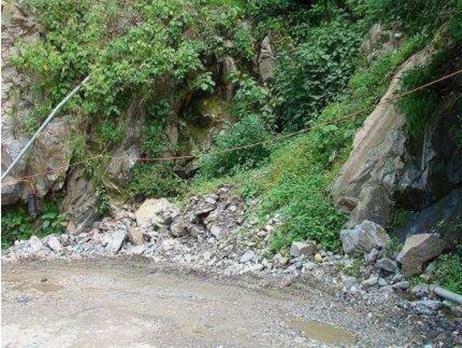
Karnprayag water pipeline broken on road side due to heavy rain fall