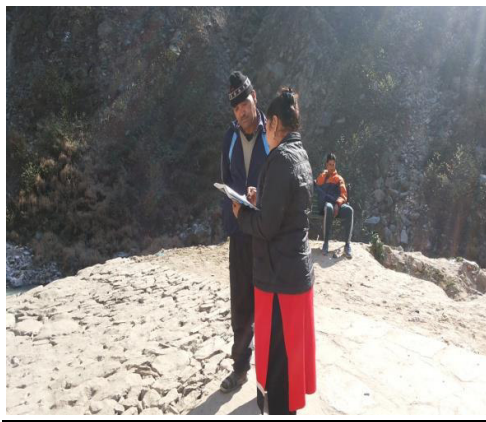
Public Consultation at Gaurikund