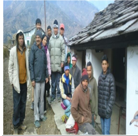
Sorag tok Dhoor