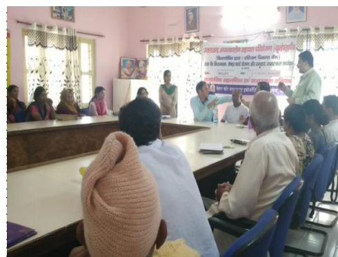
Public Consultation and Gap Awareness at Gauchar