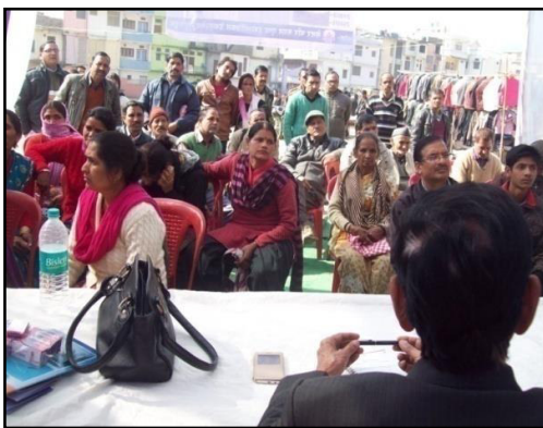
Public Consultation at Uttarkashi