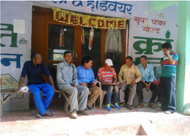
UEAP/PWD/C-26 Bageshwar District