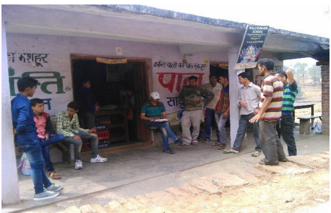
UEAP/PWD/C-46 Pithoragarh District