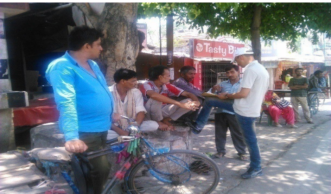
UEAP/PWD/C-1 Nainital District