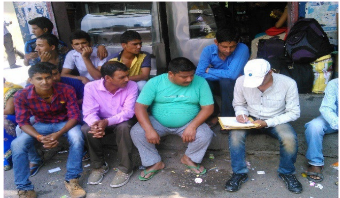
UEAP/PWD/C-73 Nainital District