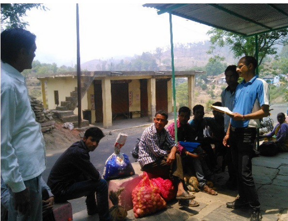
UEAP/PWD/C-60 Almora District

During January 2016 to June 2016, public consultation was conducted in Dehradun Almora, Nainital, Bageshwar Pithoragarh, Chamoli, Pauri districts. Public Consultation was also arranged in the sub projects which were initially categorized B and a resettlement plan was prepared accordingly. The objective of this Public Consultation was to reconfirm that still there is no impact on road side vendors during construction activity.