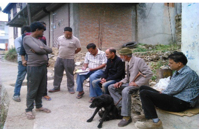
UEAP/PWD/C-12 Pithoragarh District