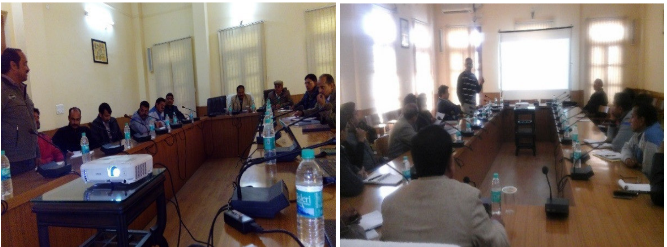
Orientation of PIU and Civil Work Contactors in Kumaun Region