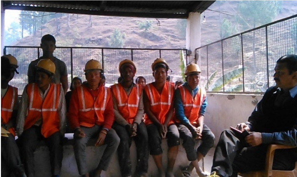
Labours Participating in the awareness camp at Bilona Bridge (C-2 A)