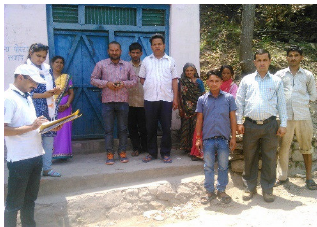
UEAP/PWD/C-61 Almora District