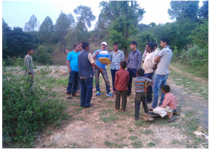
UEAP/PWD/C-47 Bageshwar District