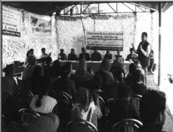
Public Consultation at Uttarkashi