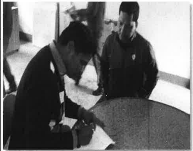
Public Consultation at Sirkha