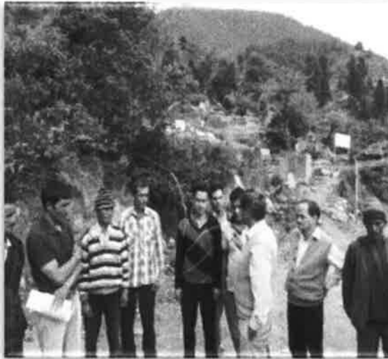
Public Consultation at Teekh