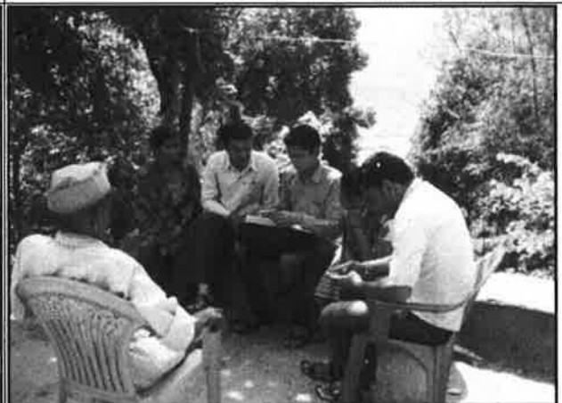
Public Consultation at Rudrapravag