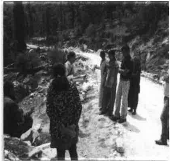
Public Consultation at Teekh