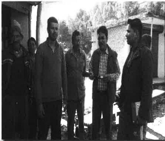
Public Consultation at Ghangar