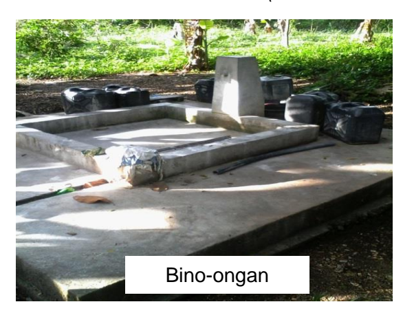
CAPABILICA: Upgrading and Expansion of CAPABILICA Waterworks System (Functional But Needs Major Repairs)