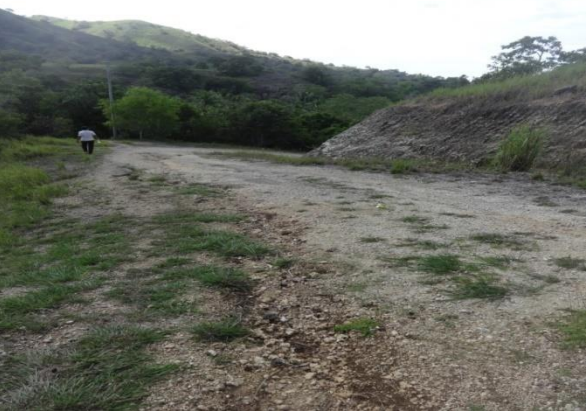
POBLACION : Installation of Poblacion Level I Waterworks System ( Totally Not Functional )