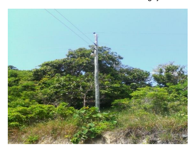
BOLOT : Barangay Bolot Electrification Project (Fully Functional)