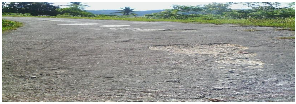
(from gravel to asphalt)