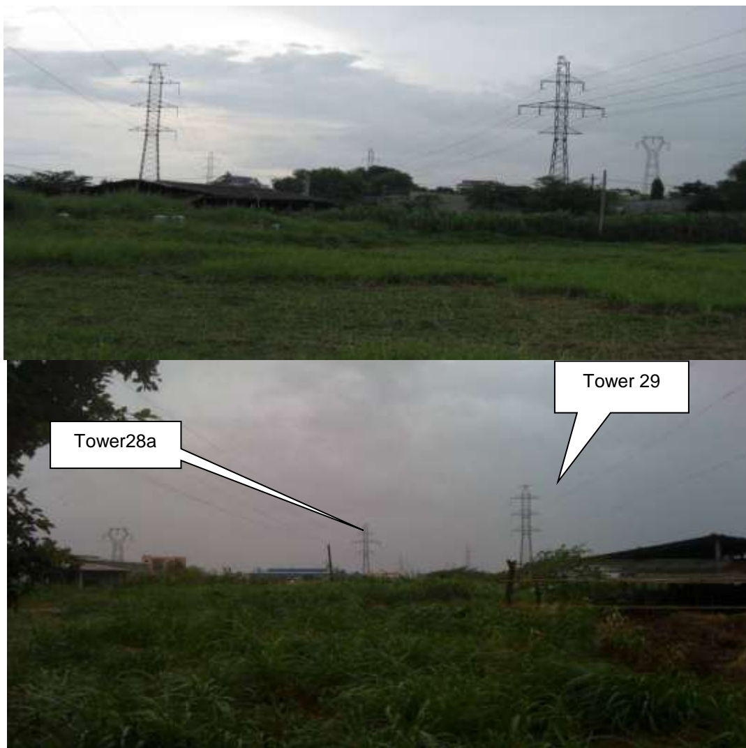
Figure 2: Existing conditions of the expected area for connection tower