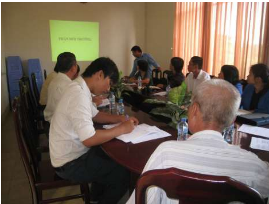
In Ba Diem commune