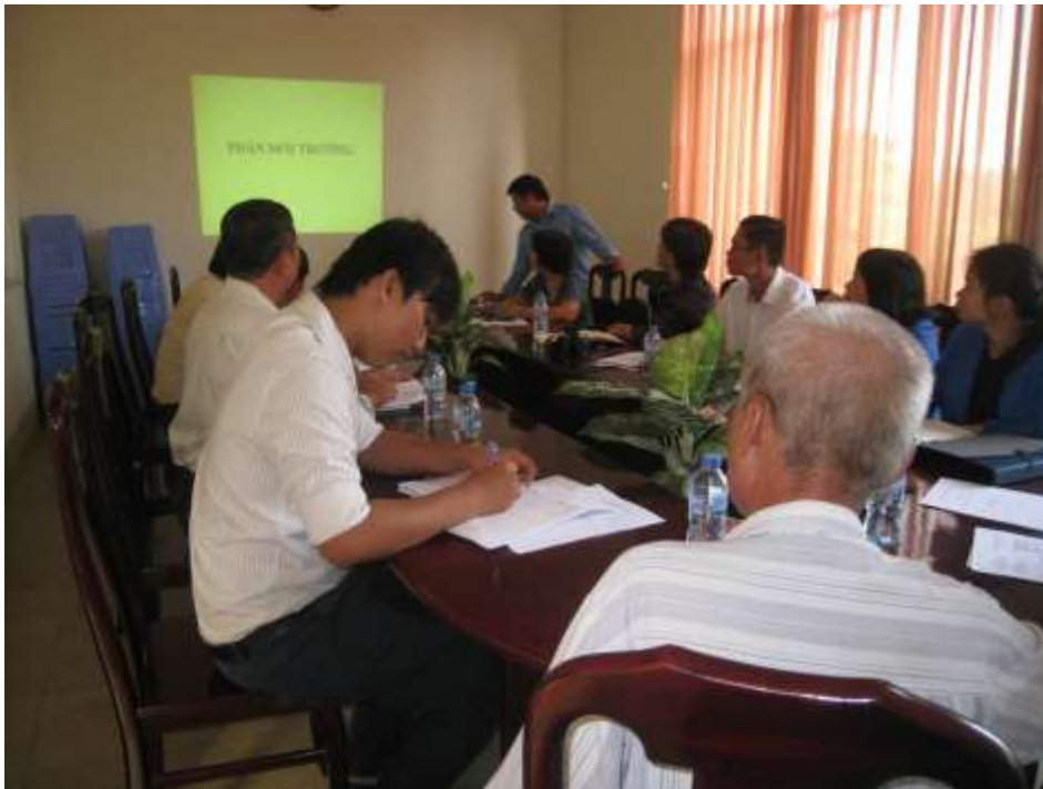
In Tan thoi nhat ward