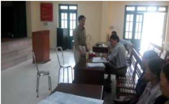
Photo 1. Consultation meeting in Doai village, Nam Hong commune, Dong Anh district, Ha Noi city, dated October 30 th 2013