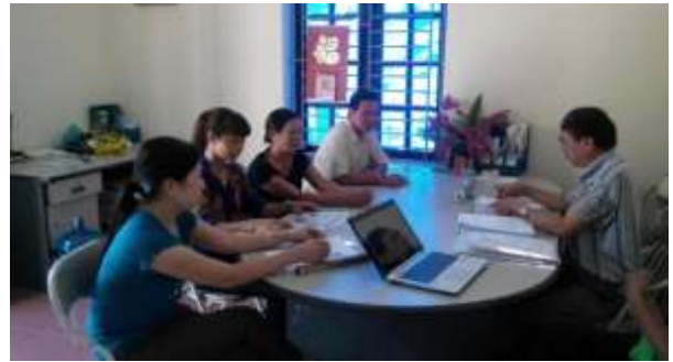
Photo 4. Consultation meeting in Dia village, Nam Hong commune, Dong Anh district, Ha Noi city, dated October 30 th 2013