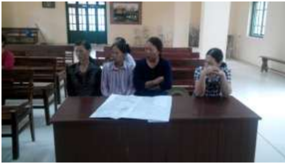
Photo 3. Consultation meeting in Doai village, Nam Hong commune, Dong Anh district, Ha Noi city, dated October 30 th 2013