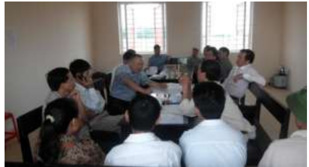
Photo 6. Consultation meeting in Thuy Ha village, Bac Hong commune, Dong Anh district, Ha Noi city, dated October 30 th 2013