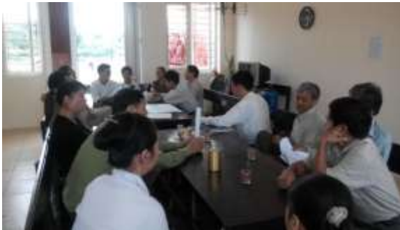
Photo 5. Consultation meeting in Thuy Ha village, Bac Hong commune, Dong Anh district, Ha Noi city, dated October 30 th 2013