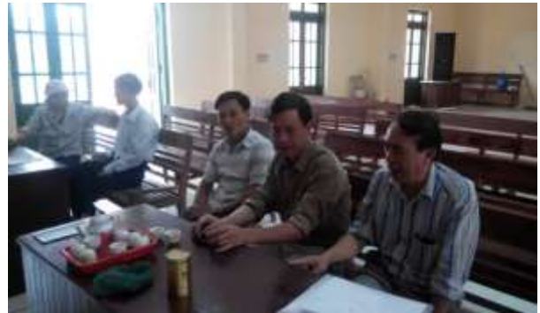
Photo 2. Consultation meeting in Doai village, Nam Hong commune, Dong Anh district, Ha Noi city, dated October 30 th 2013