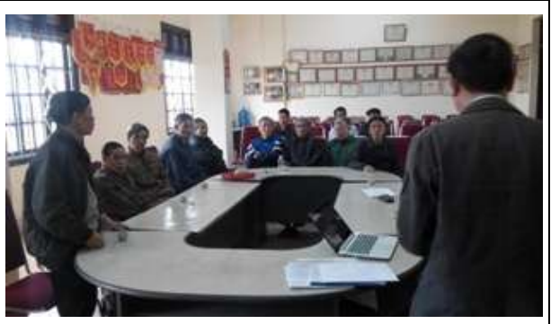
Photo10. Consultation meeting in Quang Minh commune, Dong Anh district, Ha Noi city, dated November 30 th 2013