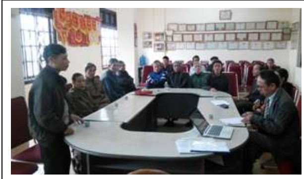
Photo9. Consultation meeting in Quang Minh commune, Dong Anh district, Ha Noi city, dated November 30 th 2013