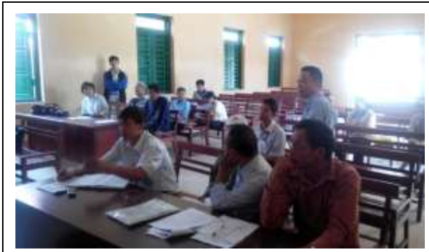
Photo7. Consultation meeting in Huong Gia village, Phu Cuong commune, Dong Anh district, Ha Noi city, dated November 12 th 2013