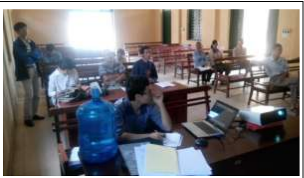
Photo8. Consultation meeting in Huong Gia village, Phu Cuong commune, Dong Anh district, Ha Noi city, dated November 12 th 2013