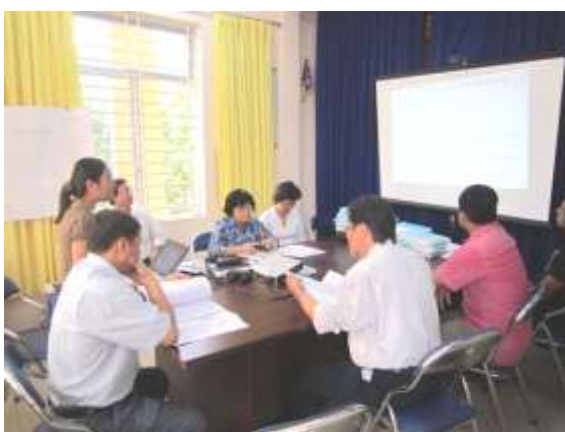
Photo of the meeting on public consultation in ward 5 district 8 (Oct. 31 st 2013)