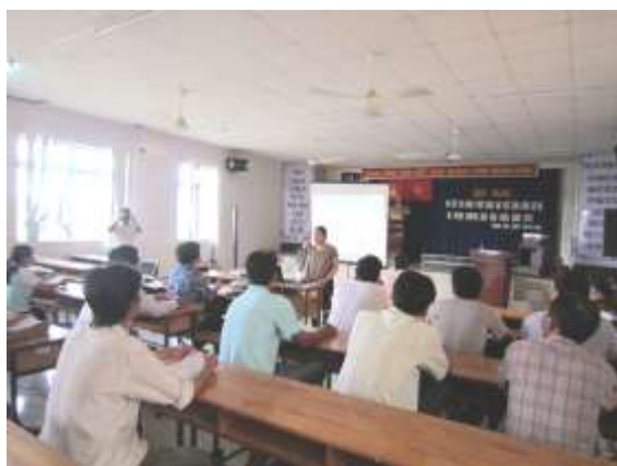
Photo of the meeting on public consultation in Phong Phu commune (Oct. 31 st 2013)