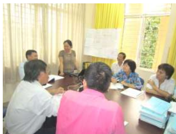
Photo of the meeting on public consultation in ward 5 district 8 (Oct. 31 st 2013)