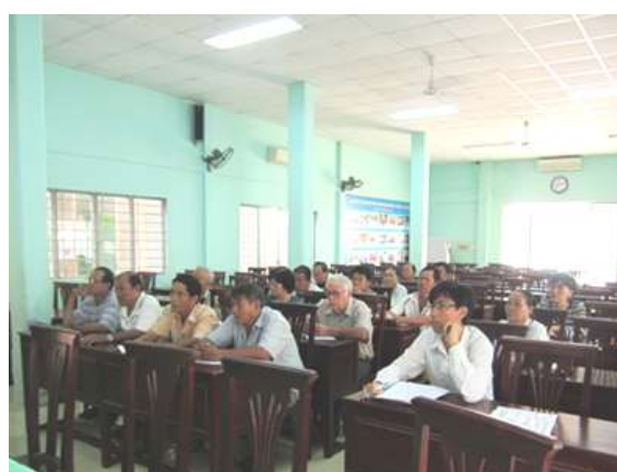
Photo of the meeting on public consultation in Binh Hung commune (Nov. 1 st 2013)