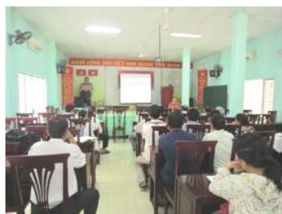
Photo of the meeting on public consultation in Binh Hung commune (Nov. 1 st 2013)