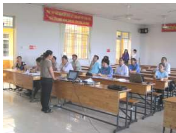
Photo of the meeting on public consultation in Phong Phu commune (Oct. 31 st 2013)