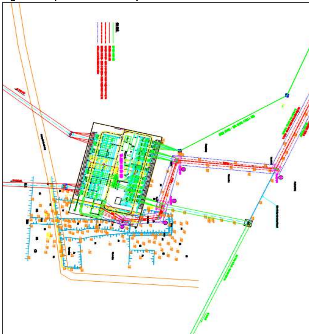
Figure 1. Map of Binh Chanh expansion

14. The financial source for compensation and assistance for acquiring land to expand Binh Chanh substation is PTC4. It is a subsidiary of EVNHCM.