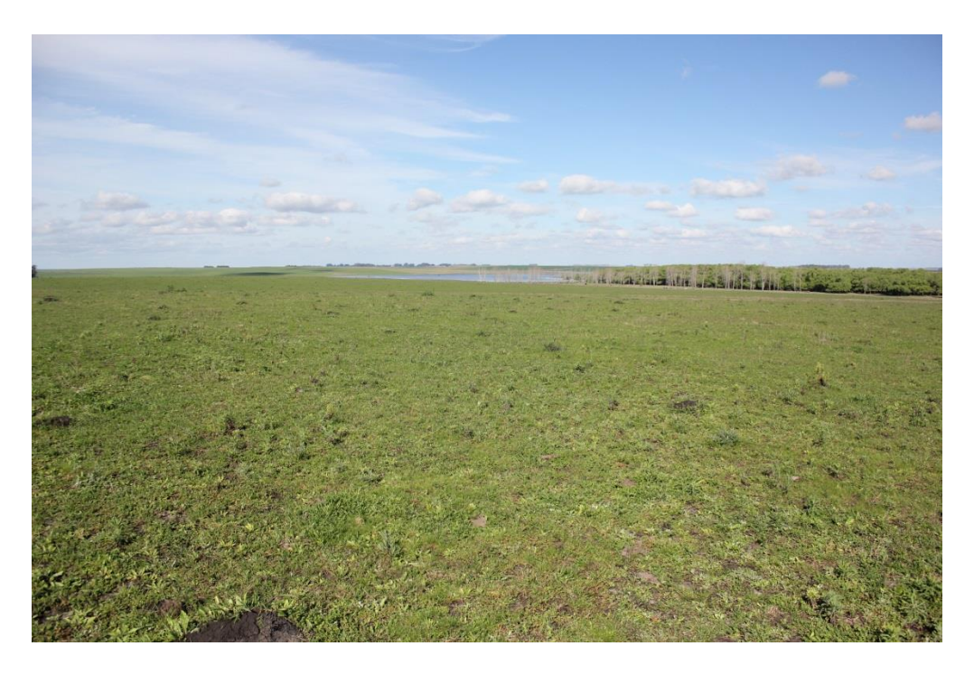
Figure 3: View of Young site