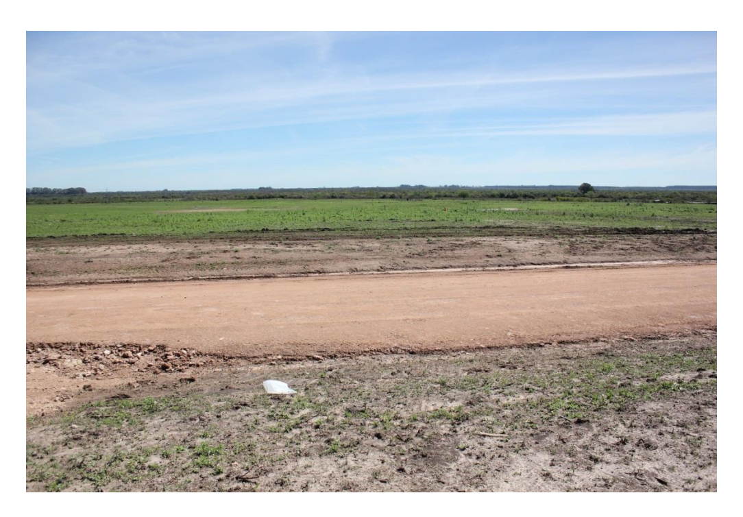
Figure 1: View of Raditon Site and initial construction activity