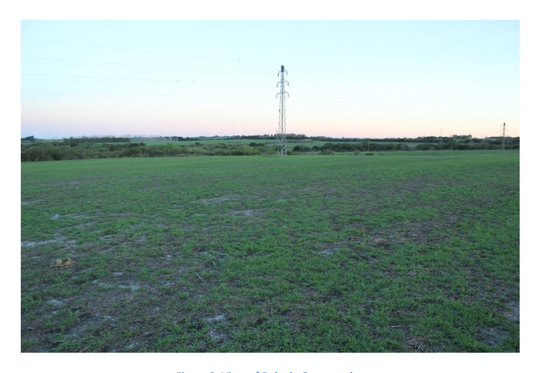
Figure 2: View of Bola de Oro complex